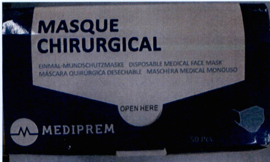
Figure 1. Unnotified Masque Chirurgical Jetable (Disposable Medical Face Mask)

The Food and Drug Administration (FDA) warns all healthcare professionals and the general public NOT TO PURCHASE AND USE the unnotified medical device product: