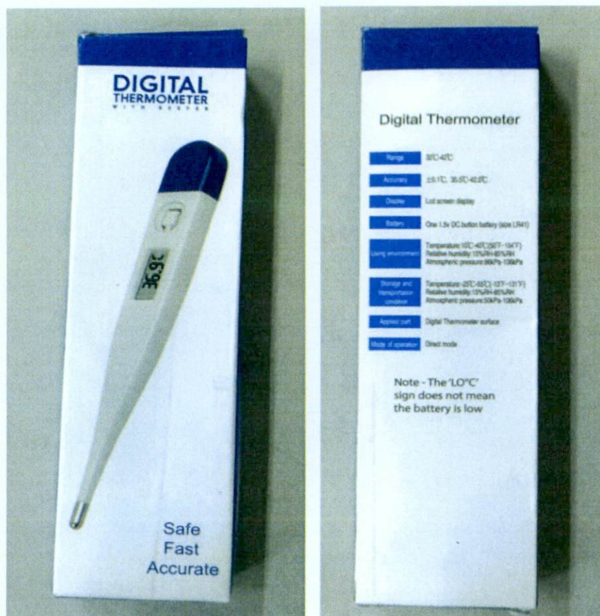
Figure 1. Unregistered Digital Thermometer with Beeper

The Food and Drug Administration (FDA) warns all healthcare professionals and the general public NOT TO PURCHASE AND USE the unregistered medical device product: