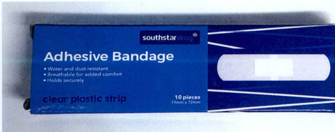
Figure 1. Unnotified Southstardrug® Adhesive Bandage Clear Plastic Strip

The Food and Drug Administration (FDA) warns all healthcare professionals and the general public NOT TO PURCHASE AND USE the unnotified medical device products: