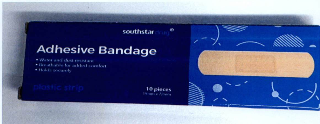
Figure 2. Unnotified Southstardrug® Adhesive Bandage Plastic Strip