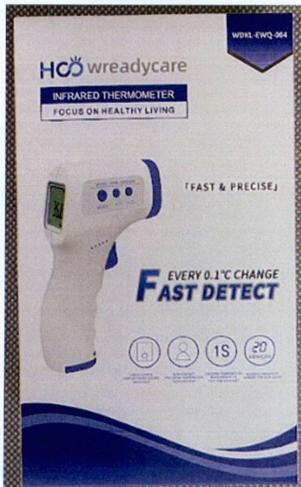
Figure 1. Unregistered Wreadycare Infrared Thermometer

The Food and Drug Administration (FDA) warns all healthcare professionals and the general public NOT TO PURCHASE AND USE the unregistered medical device product: