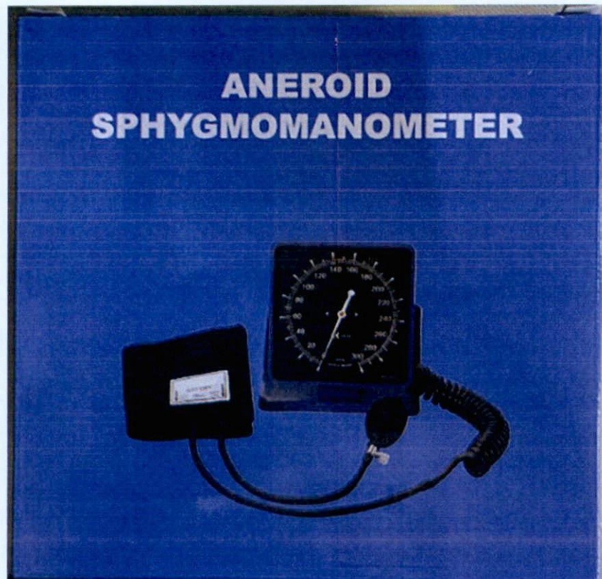
Figure 1. Unnotified Aneroid Sphygmomanometer

The Food and Drug Administration (FDA) warns all healthcare professionals and the general public NOT TO PURCHASE AND USE the following unnotified medical device product: