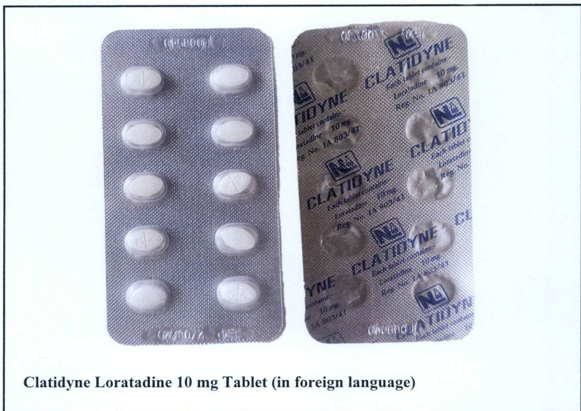
Clatidyne Loratadine 10 mg Tablet (in foreign language)

The Food and Drug Administration (FDA) advises the public against the purchase and use of the following unregistered drug products: