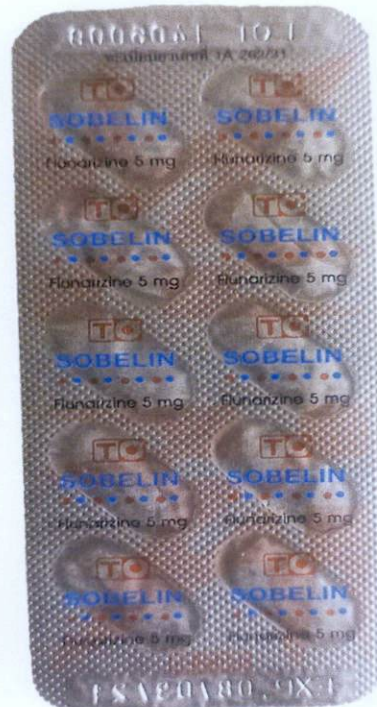
TO Sobelin Flunarizine 5 mg (in foreign language)