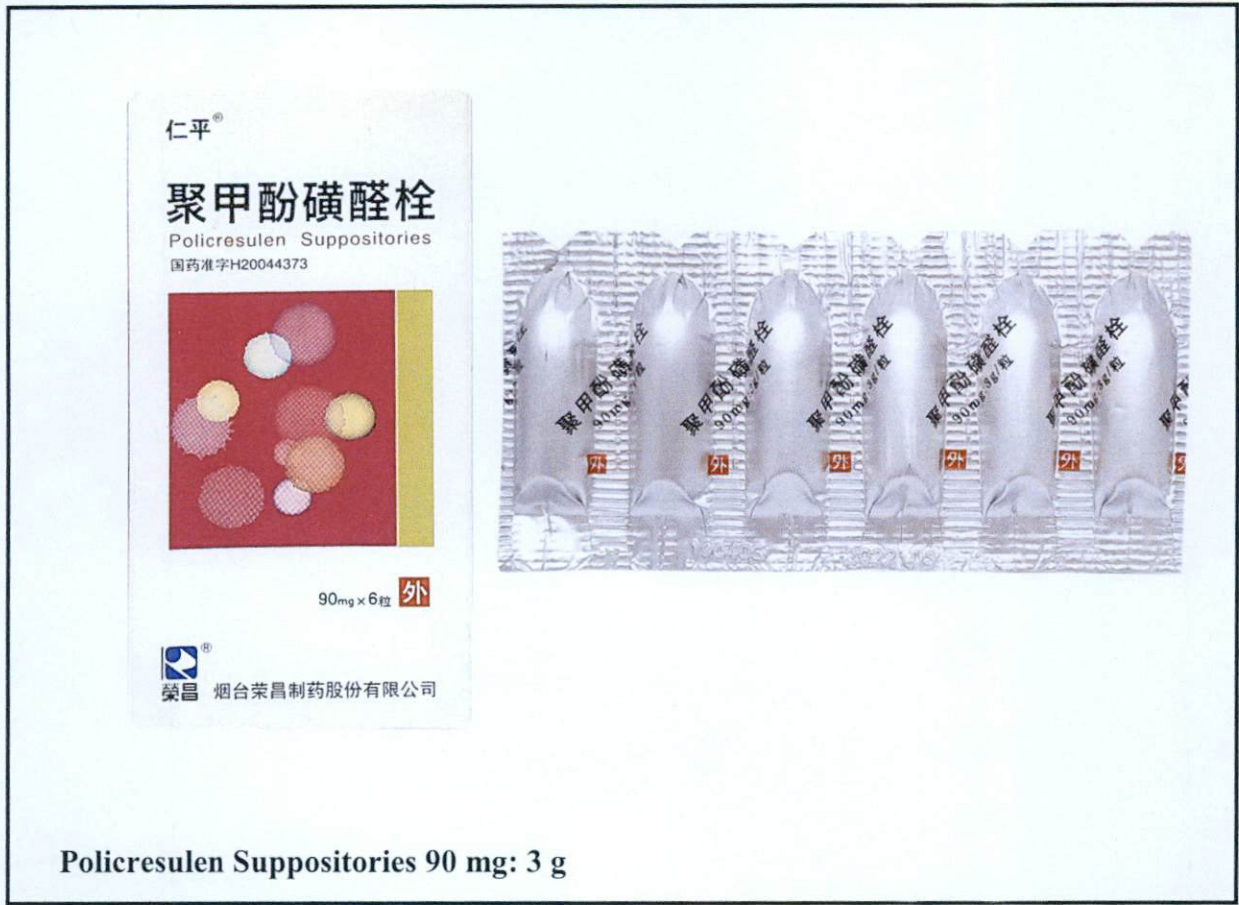
Figure 3. Unregistered drug