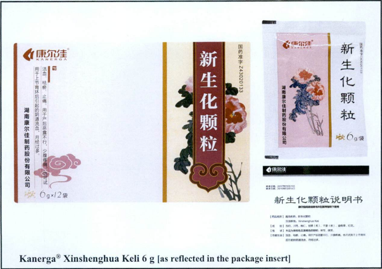
Figure 2. Unregistered drug