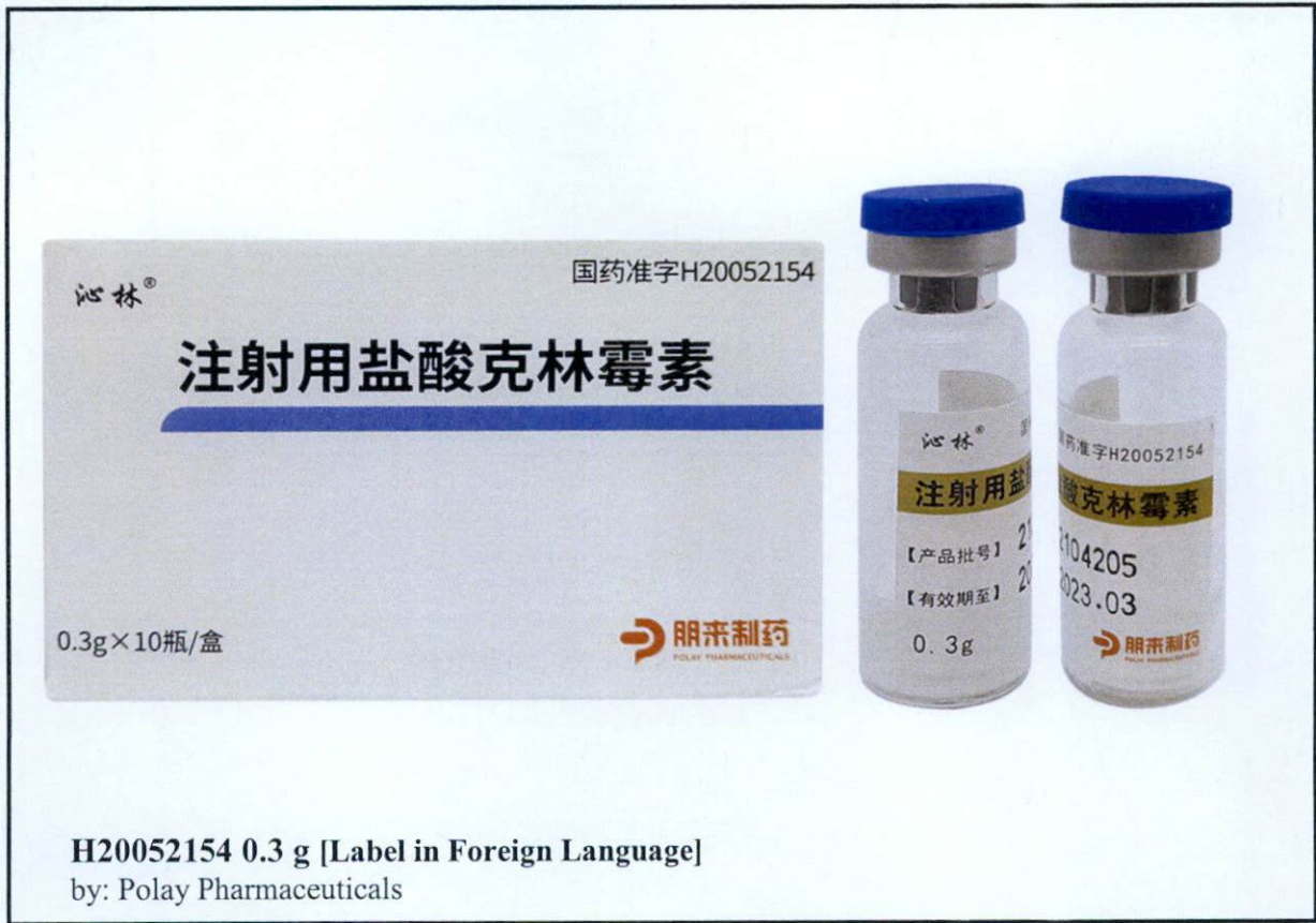
Figure 2. Unregistered drug