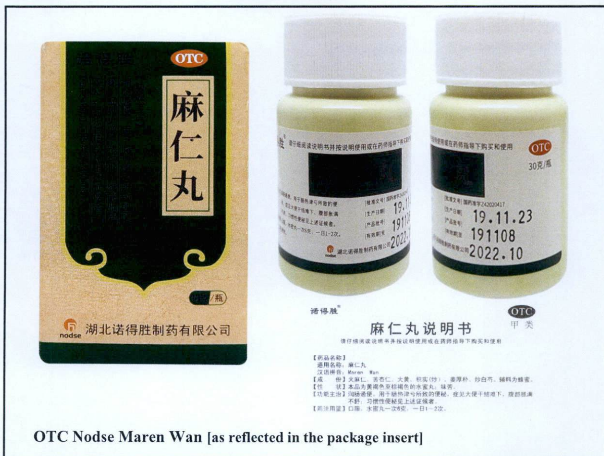
Figure 1. Unregistered drug

The Food and Drug Administration (FDA) advises the public against the purchase and use of the following unregistered drug products: