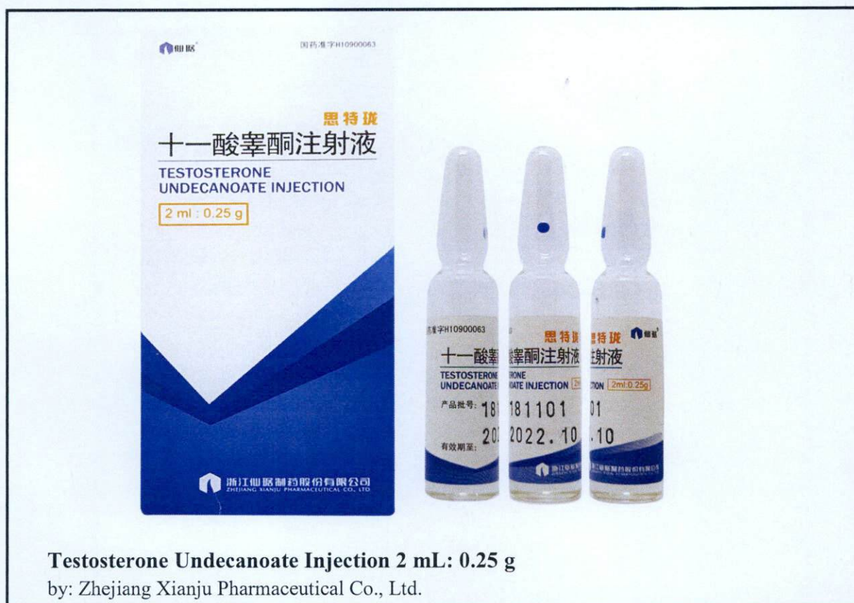
Figure 2. Unregistered drug