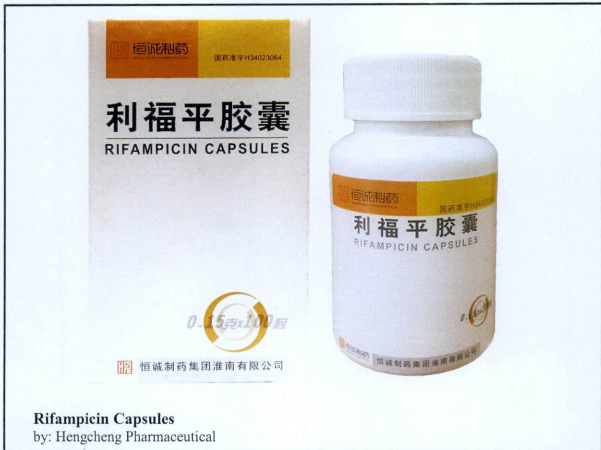
Rifampicin Capsules by: Hengcheng Pharmaceutical

The Food and Drug Administration (FDA) advises the public against the purchase and use of the following unregistered drug products: