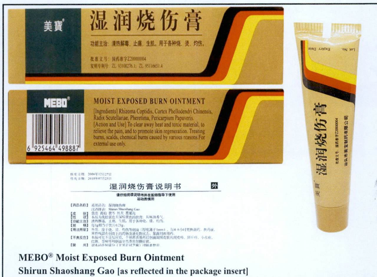
MEBO® Moist Exposed Burn Ointment Shirun Shaoshang Gao [as reflected in the package insert]