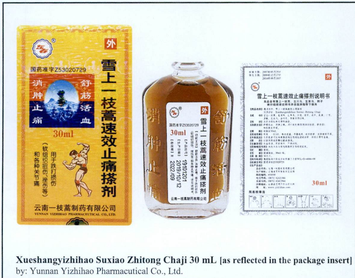
Xueshangyizhihao Suxiao Zhitong Chaji 30 mL [as reflected in the package insert] by: Yunnan Yizhihao Pharmaceutical Co., Ltd.

The Food and Drug Administration (FDA) advises the public against the purchase and use of the following unregistered drug products: