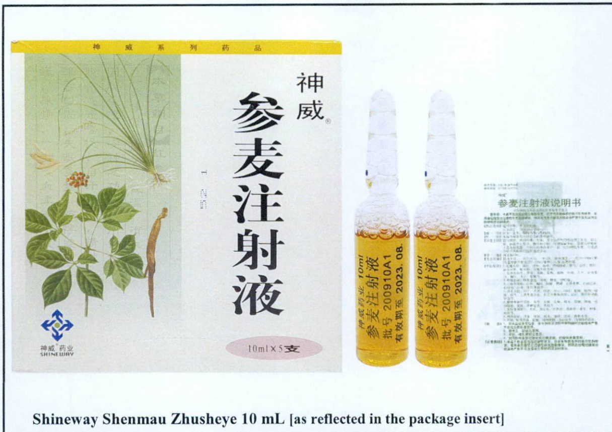
Shineway Shenmau Zhusheyey 10 mL [as reflected in the package insert]