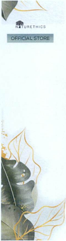
Figure 4. Unregistered NATURETHICS Fat Burner Food Supplement