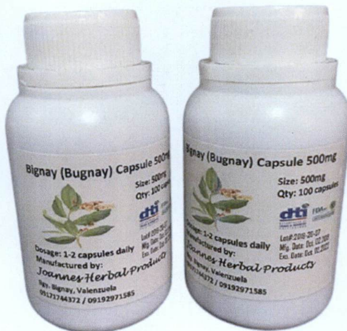
Figure 3. Unregistered UNBRANDED Bignay (Bugnay) Capsule 500mg