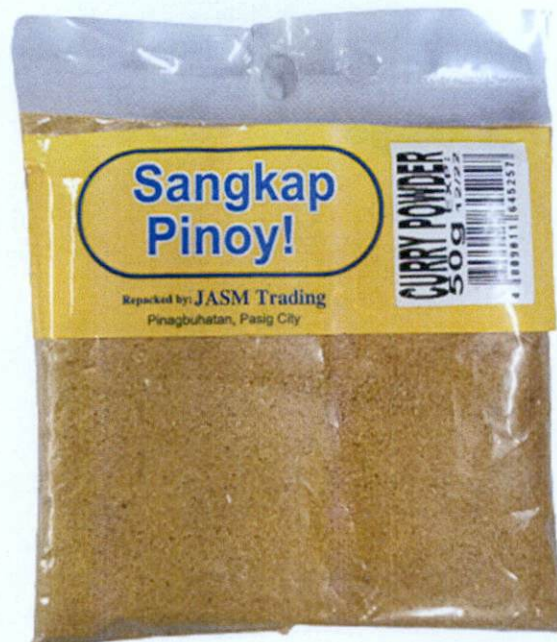
Figure 1. Unregistered SANGKAP PINOY! Curry Powder

The Food and Drug Administration (FDA) warns all healthcare professionals and the general public NOT TO PURCHASE AND CONSUME the following unregistered food product and food supplements: