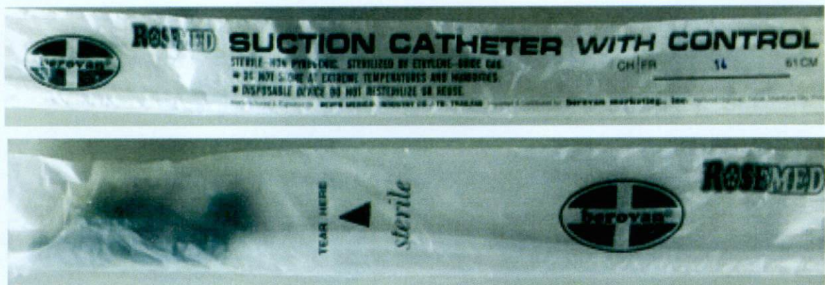
Figure 1. Unregistered Rosemed Suction Catheter with Control

The Food and Drug Administration (FDA) warns all healthcare professionals and the general public NOT TO PURCHASE AND USE the unregistered medical device product: