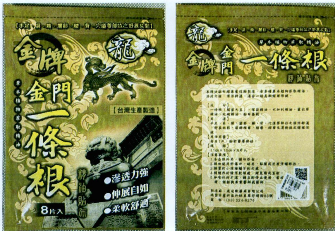
Figure 1. Unnotified Bandage (in foreign characters)

The Food and Drug Administration (FDA) warns all healthcare professionals and the general public NOT TO PURCHASE AND USE the unnotified medical device product: