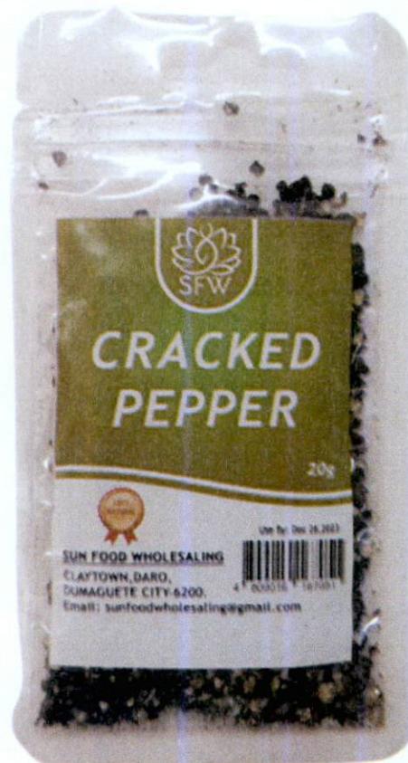
Figure 1. Unregistered SFW Cracked Pepper

The Food and Drug Administration (FDA) warns all healthcare professionals and the general public NOT TO PURCHASE AND CONSUME the following unregistered food products: