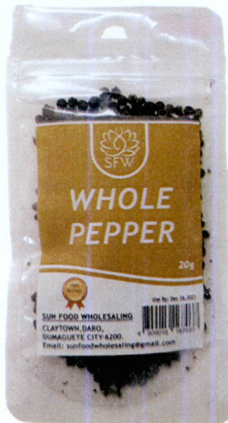
Figure 3. Unregistered SFW Whole Pepper