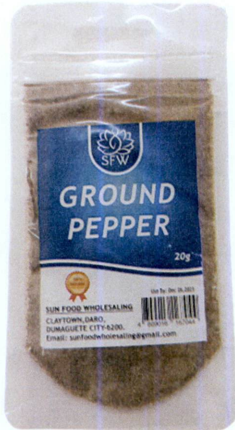
Figure 2. Unregistered SFW Ground Pepper