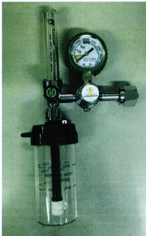
Figure 1. Unnotified Surmed® Oxygen Regulator

The Food and Drug Administration (FDA) warns all healthcare professionals and the general public NOT TO PURCHASE AND USE the unnotified medical device product: