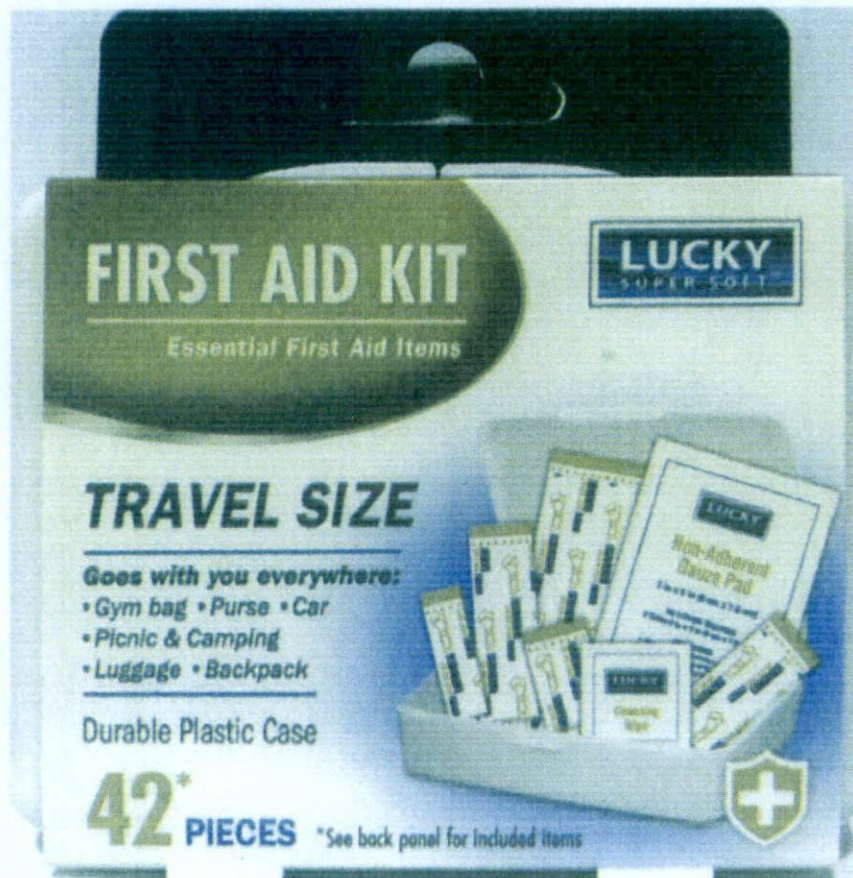
Figure 1. Unnotified Lucky Super Soft First Aid Kit - Travel Size

The Food and Drug Administration (FDA) warns all healthcare professionals and the general public NOT TO PURCHASE AND USE the unnotified medical device product: