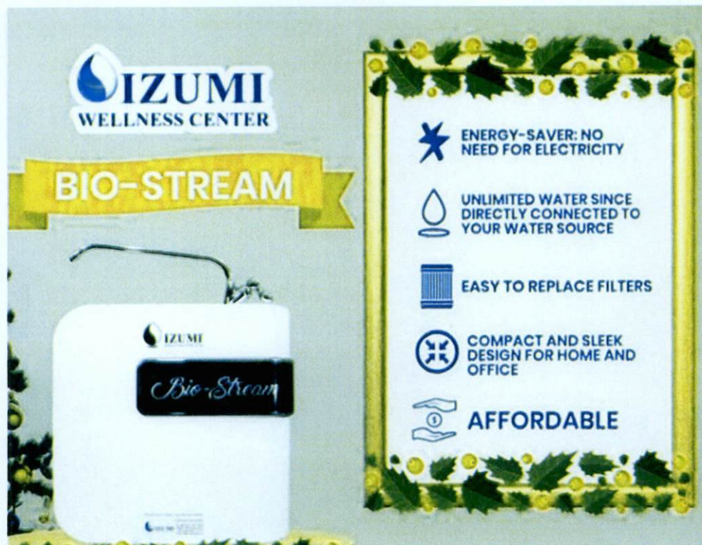
Figure 1. Unregistered IZUMI BIO-STREAM 4 STAGES DRINKING WATER SYSTEM

The Food and Drug Administration (FDA) warns all healthcare professionals and the general public NOT TO PURCHASE AND USE the unregistered medical device product: