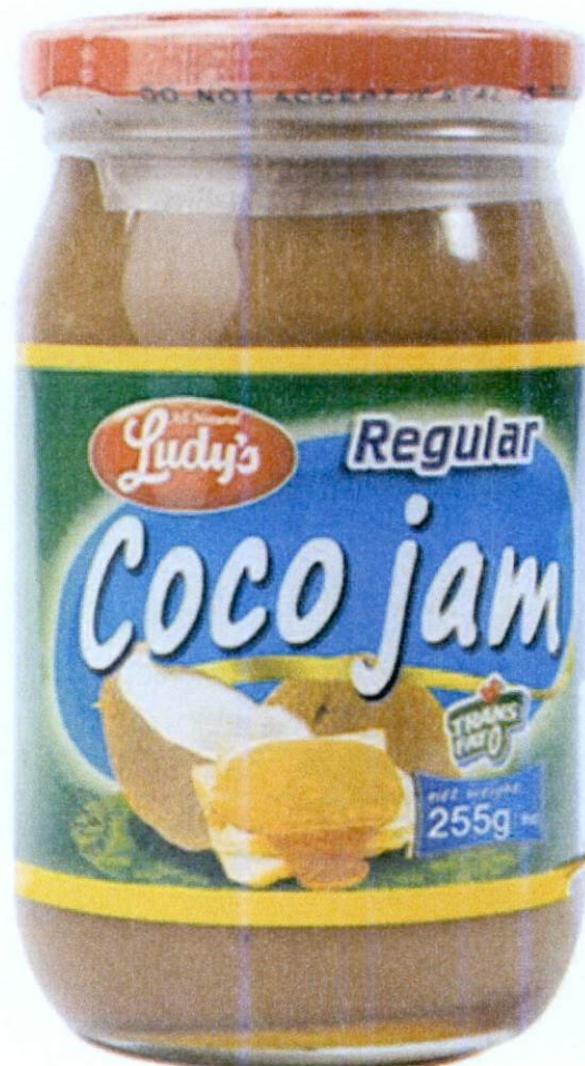
Figure 1. The Approved label of LUDY'S Regular Coco Jam with registration number FR- 4000008400772 valid until 20 September 2026 .

The Food and Drug Administration (FDA) informs the public that the food product LUDY'S Regular Coco Jam has been registered by the Market Authorization Holder (MAH) SAMUYA FOOD MANUFACTURING, INC. in accordance to existing FDA rules and regulations.