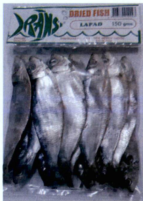
Figure 1. Approved label of RAN'S DRIED FISH Dried Lapad, FR- 4000008661302 issued on 19 November 2021 valid until 19 November 2023.

The Food and Drug Administration (FDA) informs the public that the following food products have now been registered by the Market Authorization Holder (MAH) RAN'S GENERAL MERCHANDISE in accordance to existing FDA rules and regulations.