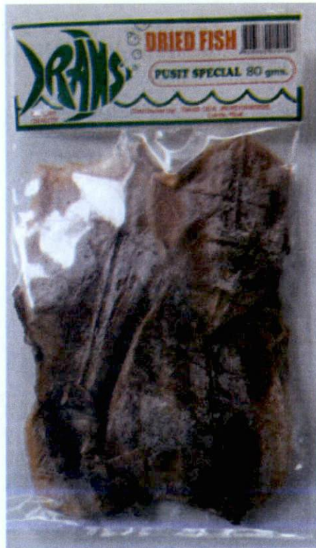
Figure 4. Approved label of RAN'S Dried Pusit Special, FR-4000008671055 issued on 19 November 2021 valid until 19 November 2023 .