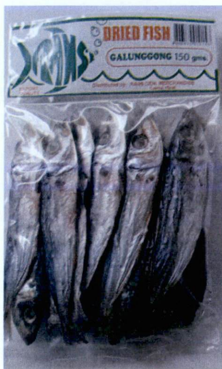
Figure 3. Approved label of RAN'S Dried Galunggong, FR-4000008675725 issued on 25 November 2021 valid until 25 November 2023 .