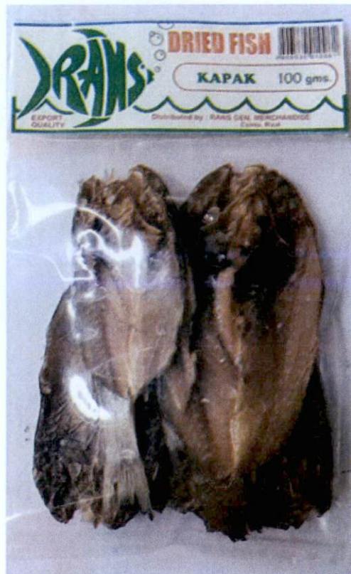
Figure 5. Approved label of RANS Dried Fish (Kapak), FR-4000008674621 issued on 23 November 2021 valid until 23 November 2023 .