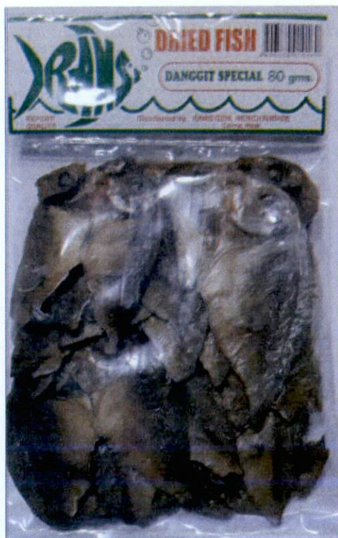
Figure 2. Approved label of RAN'S Dried Fish Danggit Special, FR-4000008671680 issued on 17 November 2021 valid until 17 November 2023 .