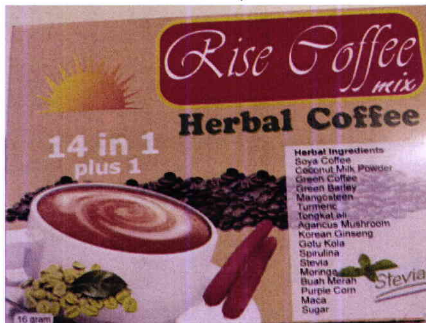
Figure 1. Approved label of RISE Herbal Coffee, FR-4000002667623 issued on 14 November 2019 valid until 28 May 2025.

The Food and Drug Administration (FDA) informs the public that the food product RISE Herbal Coffee has been registered by the Market Authorization Holder (MAH) MMMC FOOD MANUFACTURING AND TRADING in accordance to existing FDA rules and regulations.