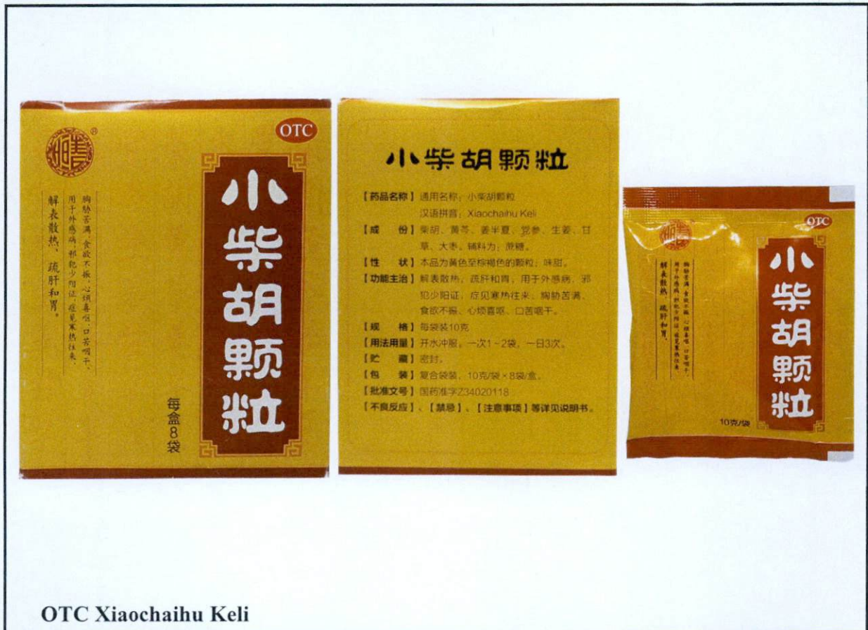
Figure 3. Unregistered drug