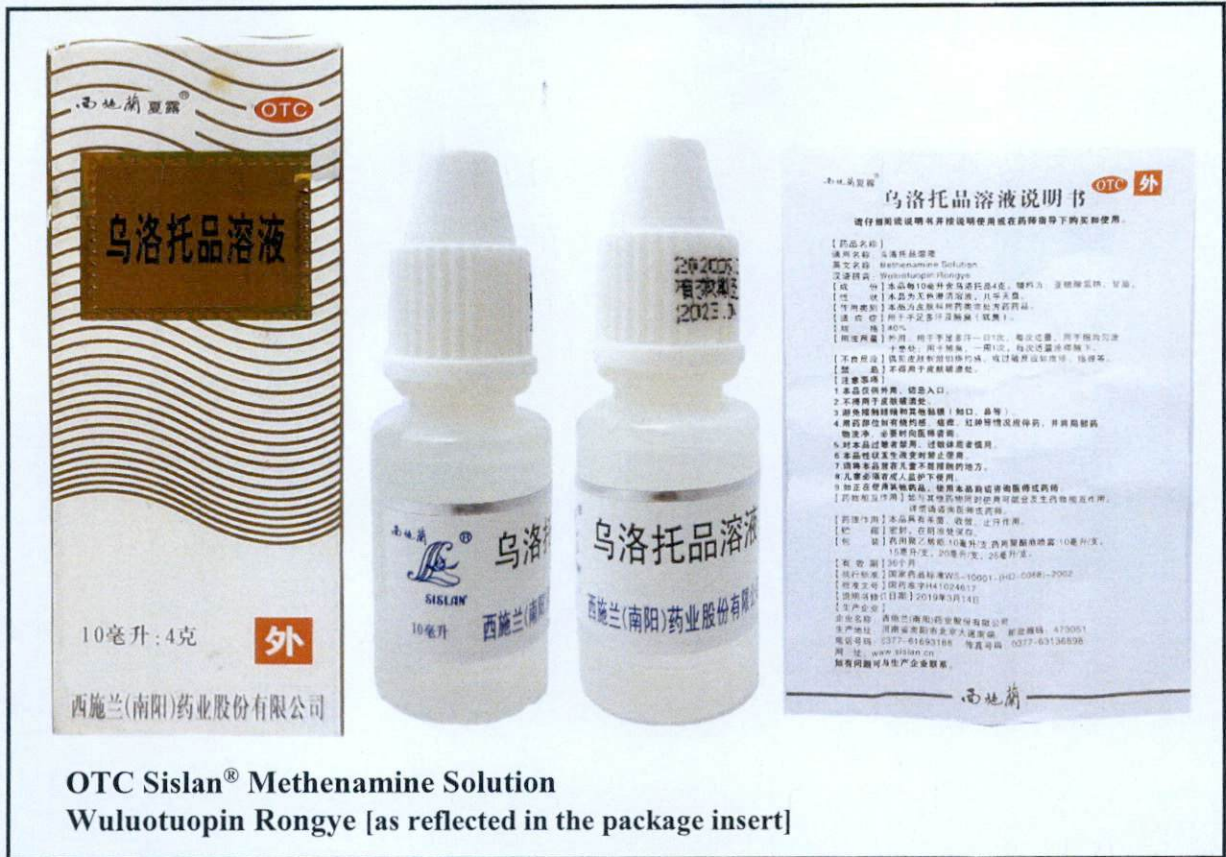
Figure 2. Unregistered drug