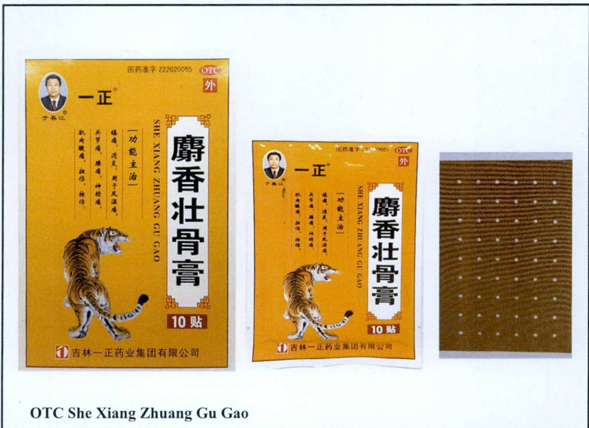
OTC She Xiang Zhuang Gu Gao

The Food and Drug Administration (FDA) advises the public against the purchase and use of the following unregistered drug products: