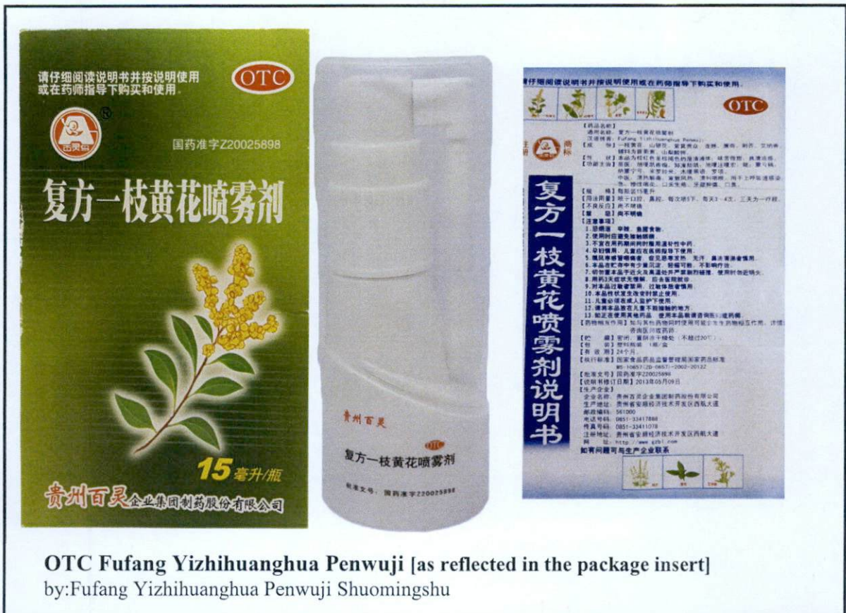
Figure 1. Unregistered drug

The Food and Drug Administration (FDA) advises the public against the purchase and use of the following unregistered drug products: