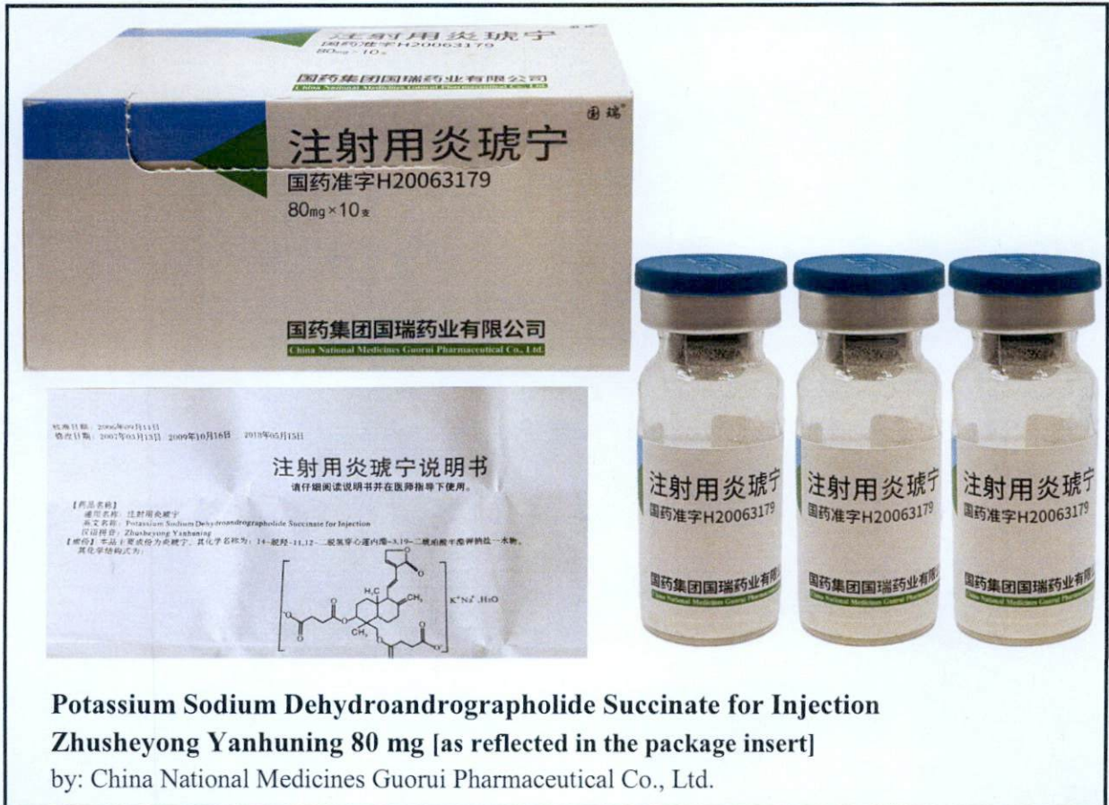
Figure 3. Unregistered drug