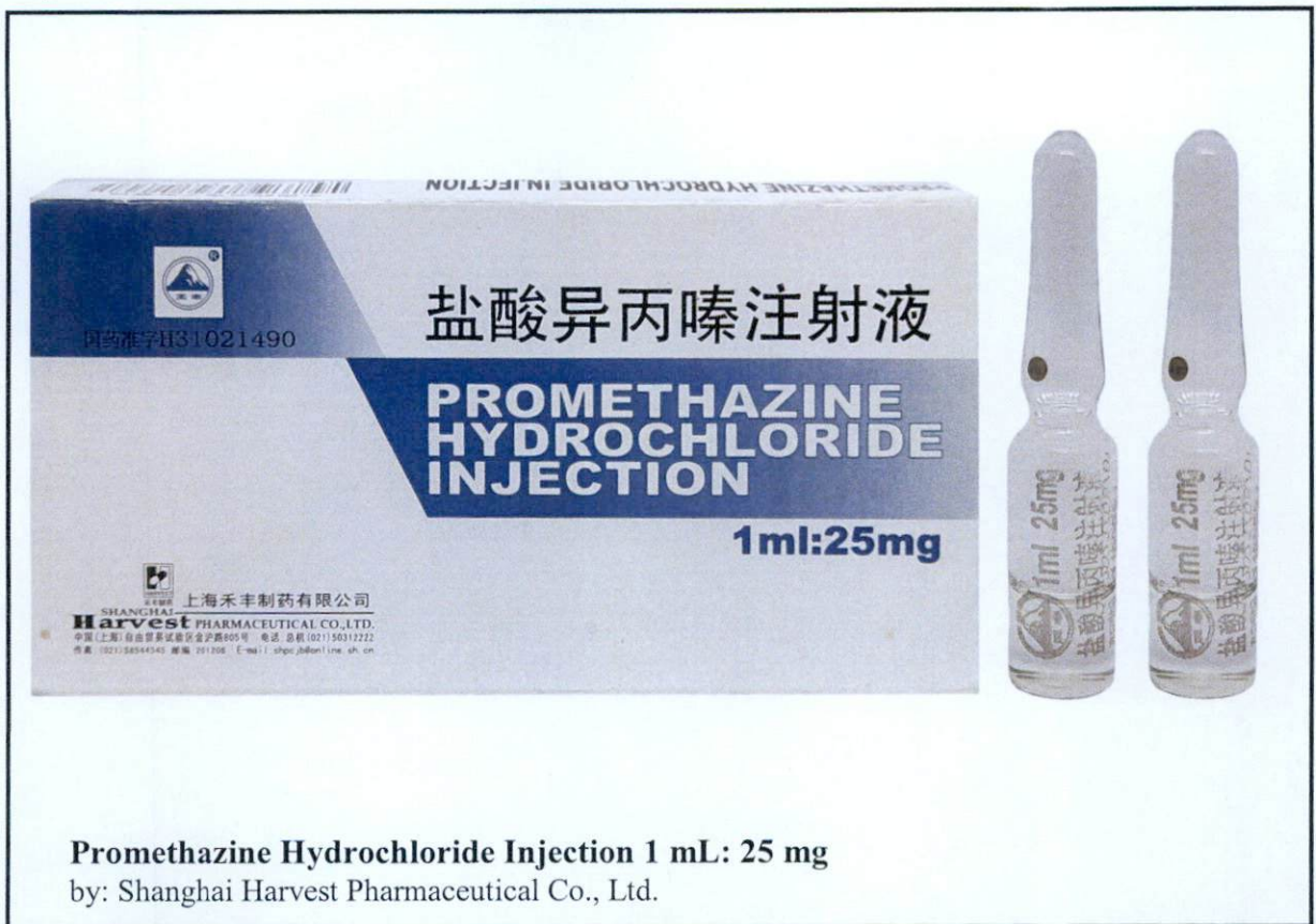
Figure 2. Unregistered drug