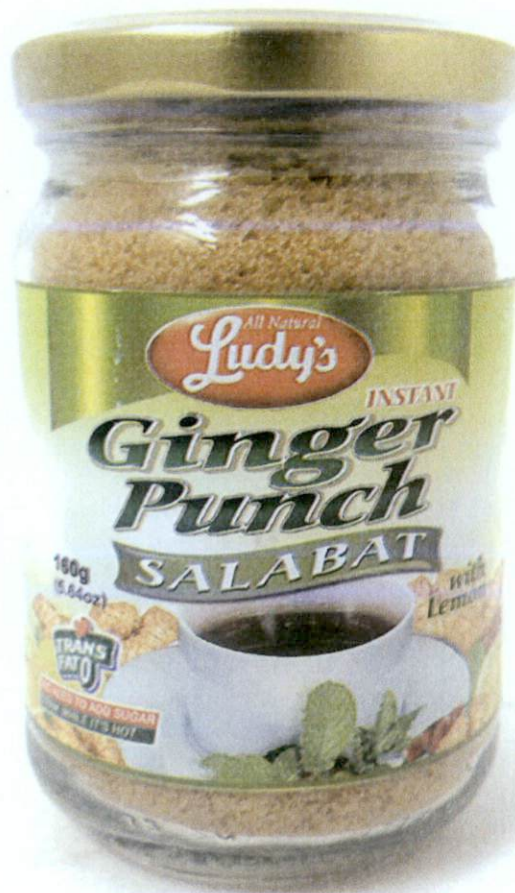
Figure 1. The Approved label of LUDY'S Instant Ginger Punch Salabat with Lemon with registration number FR- 4000005622803 valid until 14 February 2025 .

The Food and Drug Administration (FDA) informs the public that the food product LUDY'S Instant Ginger Punch Salabat with Lemon has been registered by the Market Authorization Holder (MAH) SAMUYA FOOD MANUFACTURING, INC. in accordance to existing FDA rules and regulations.