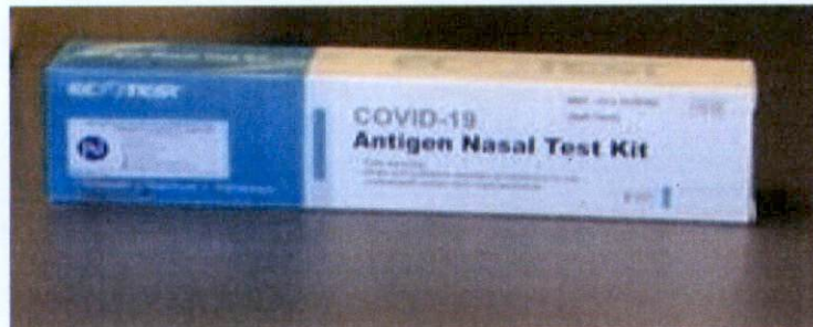
Figure 1. Uncertified ECOTEST COVID-19 Antigen Nasal Test Kit

The Food and Drug Administration (FDA) warns all healthcare professionals and the general public NOT TO PURCHASE AND USE the uncertified COVID-19 test kit: