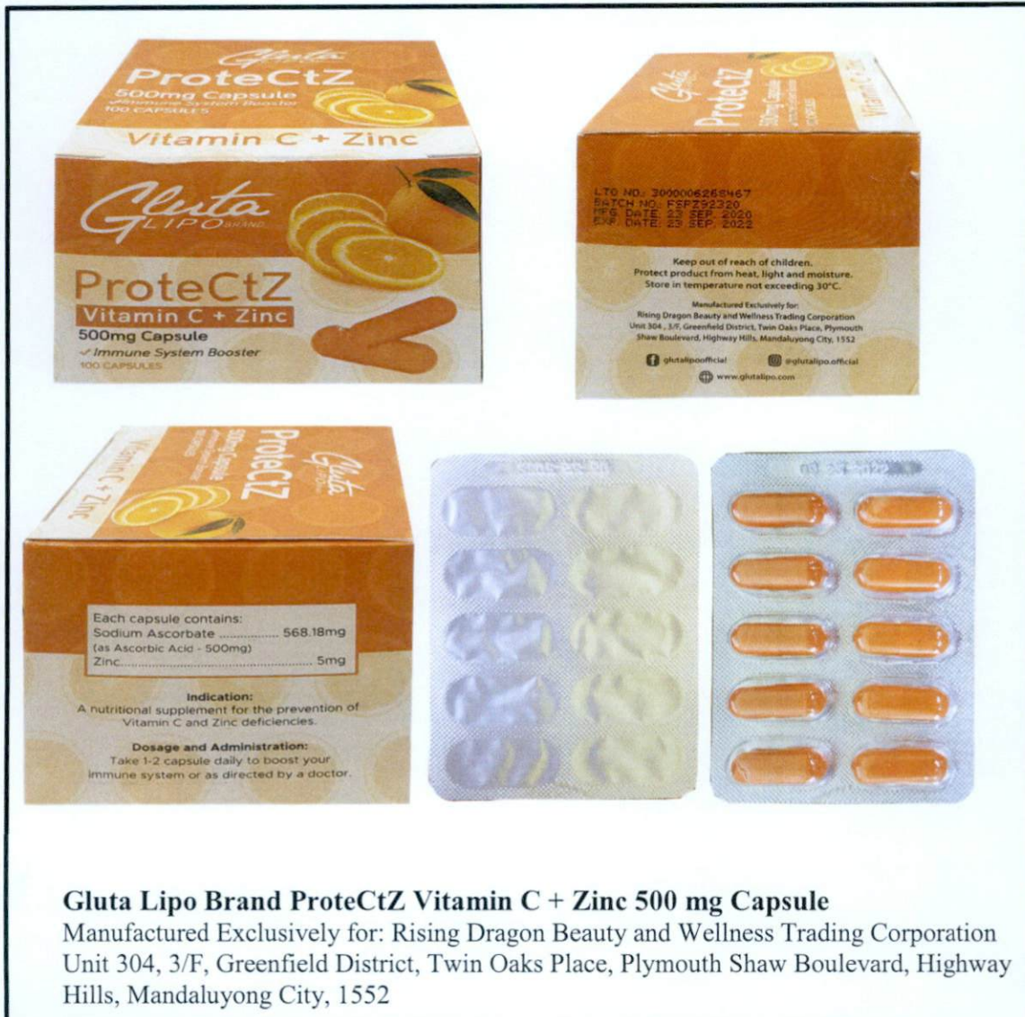
Gluta Lipo Brand ProteCtZ Vitamin C + Zinc 500 mg Capsule Manufactured Exclusively for: Rising Dragon Beauty and Wellness Trading Corporation Unit 304, 3/F, Greenfield District, Twin Oaks Place, Plymouth Shaw Boulevard, Highway Hills, Mandaluyong City, 1552

The Food and Drug Administration (FDA) advises the public against the purchase and use of the unregistered drug product: