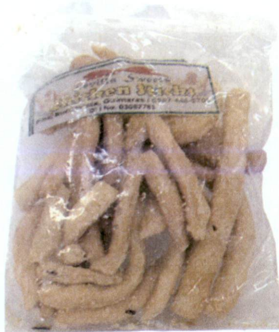
Figure 1. Unregistered SEVILLA SWEETS Chicken Sticks

The Food and Drug Administration (FDA) warns all healthcare professionals and the general public NOT TO PURCHASE AND CONSUME the following unregistered food products: