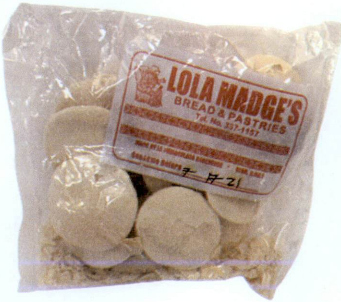
Figure 2. Unregistered LOLA MADGE'S BREAD & PASTRIES (Paborita Bread)