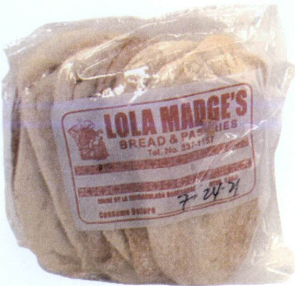
Figure 4. Unregistered LOLA MADGE'S BREAD & PASTRIES (Otap Bread)