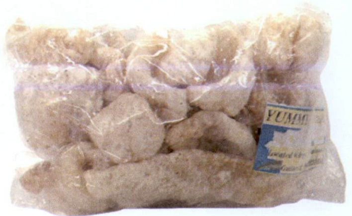
Figure 5. Unregistered YUMMY Special Chicharon