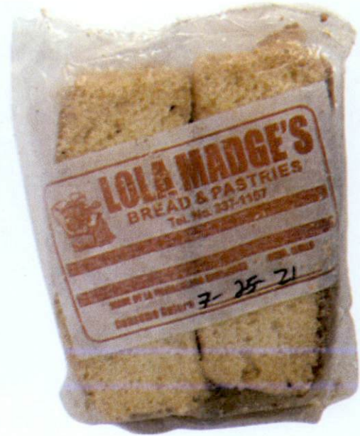
Figure 3. Unregistered LOLA MADGE'S BREAD & PASTRIES (Principe Bread)