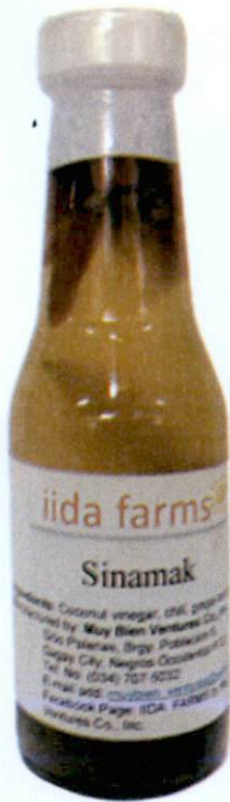
Figure 2. Unregistered IIDA FARMS Sinamak