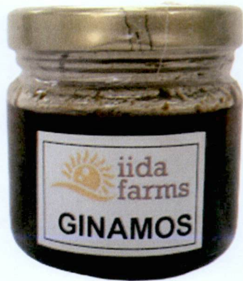
Figure 2. Unregistered IIDA FARMS Ginamos