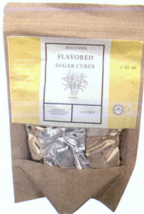
Figure 1. Unregistered IIDA FARMS TURMERIC Flavored Sugar Cubes

The Food and Drug Administration (FDA) warns all healthcare professionals and the general public NOT TO PURCHASE AND CONSUME the following unregistered food products: