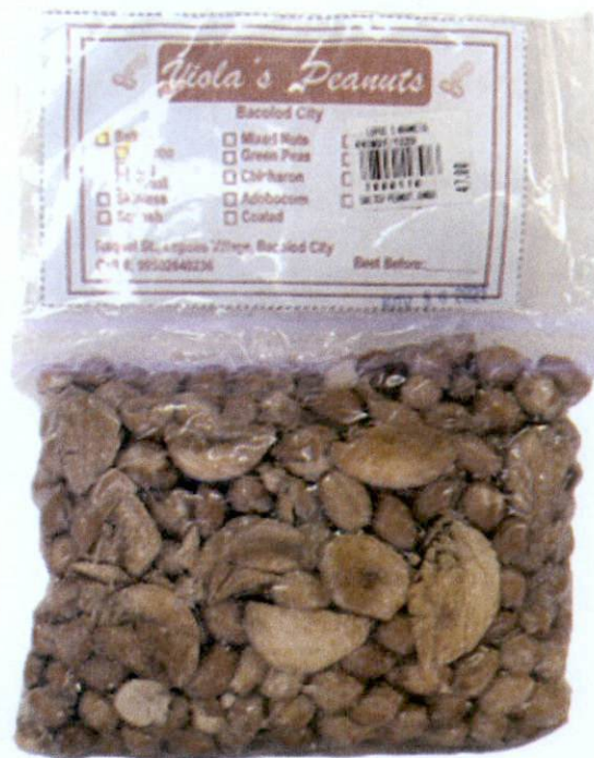
Figure 1. Unregistered VIOLA'S PEANUTS Salted Jumbo

The Food and Drug Administration (FDA) warns all healthcare professionals and the general public NOT TO PURCHASE AND CONSUME the following unregistered food products: