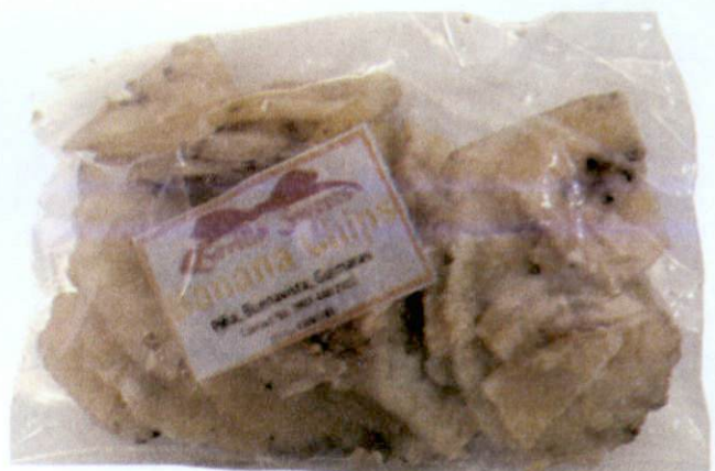
Figure 5. Unregistered SEVILLA SWEETS Banana Chips