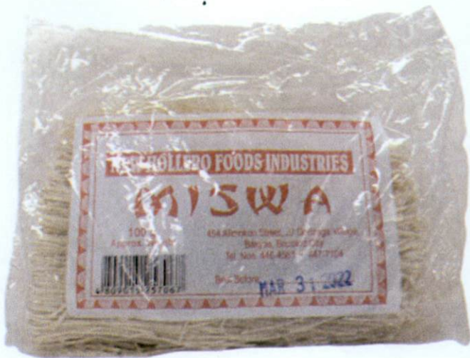
Figure 2. Unregistered NEW HOLLERO FOODS INDUSTRIES Miswa