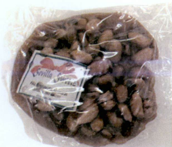
Figure 4. Unregistered SEVILLA SWEETS Bandi