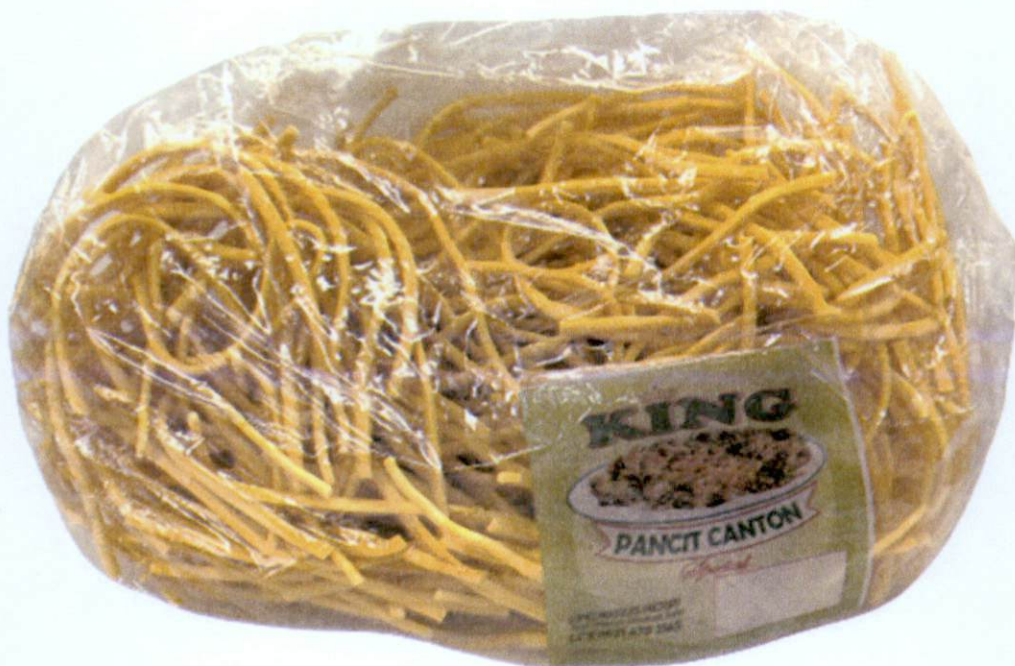
Figure 3. Unregistered KING Pancit Canton Special