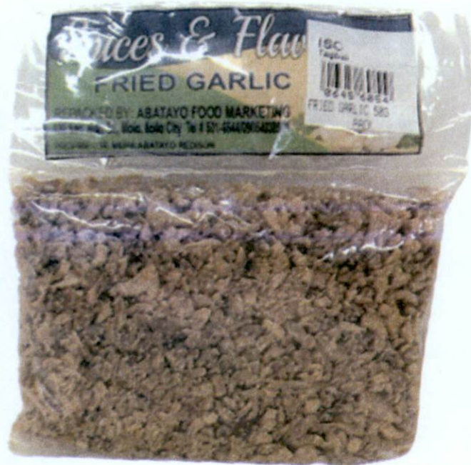
Figure 1. Unregistered SPICES & FLAVOR Fried Garlic

The Food and Drug Administration (FDA) warns all healthcare professionals and the general public NOT TO PURCHASE AND CONSUME the following unregistered food products: