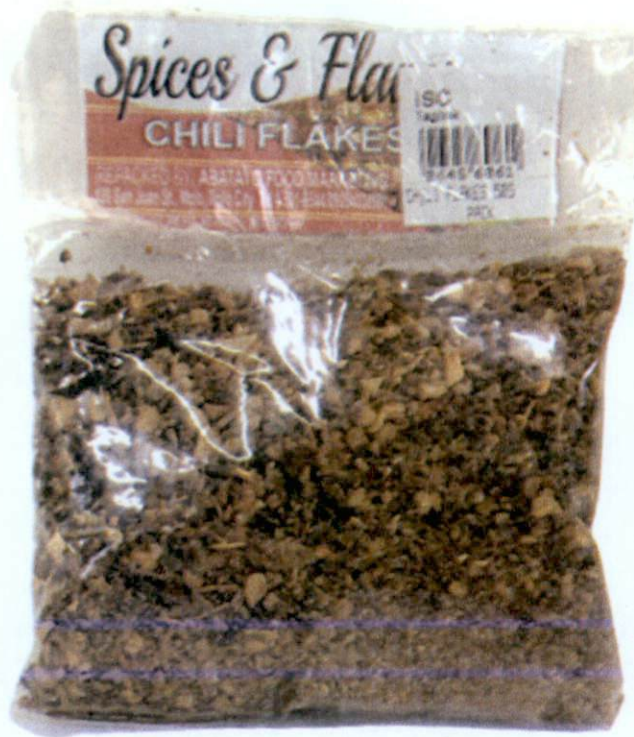
Figure 2. Unregistered SPICES & FLAVOR Chili Flakes