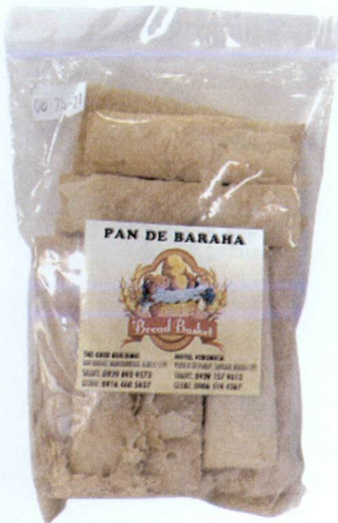
Figure 4. Unregistered BREAD BASKET Pan de Baraha