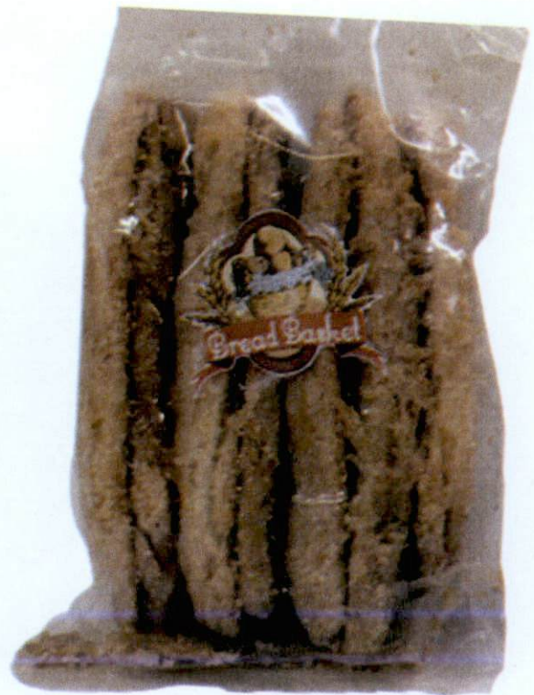
Figure 3. Unregistered BREAD BASKET Otap