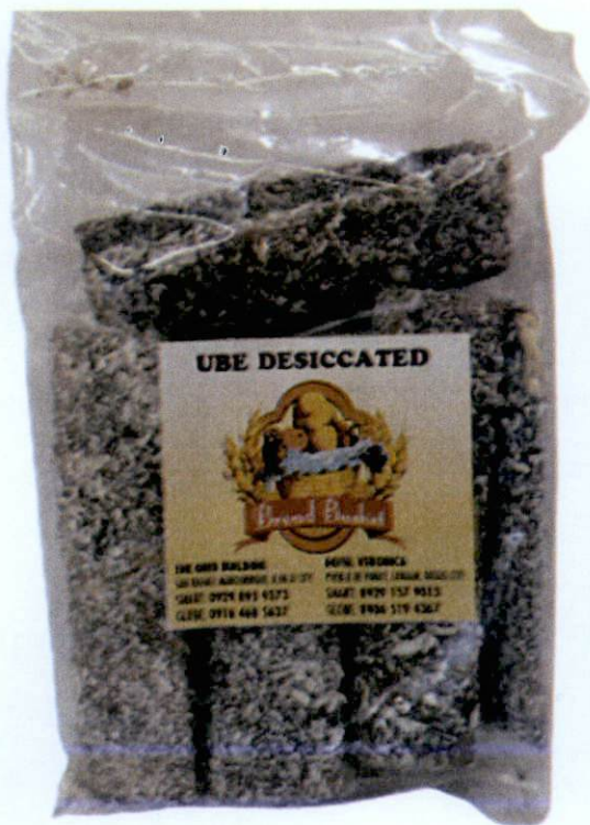
Figure 2. Unregistered BREAD BASKET Ube Desiccated