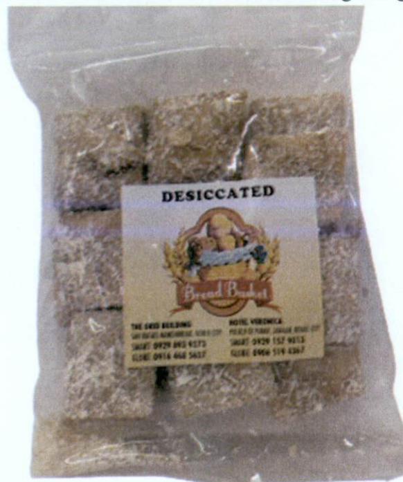
Figure 1. Unregistered BREAD BASKET Desiccated

The Food and Drug Administration (FDA) warns all healthcare professionals and the general public NOT TO PURCHASE AND CONSUME the following unregistered food products: