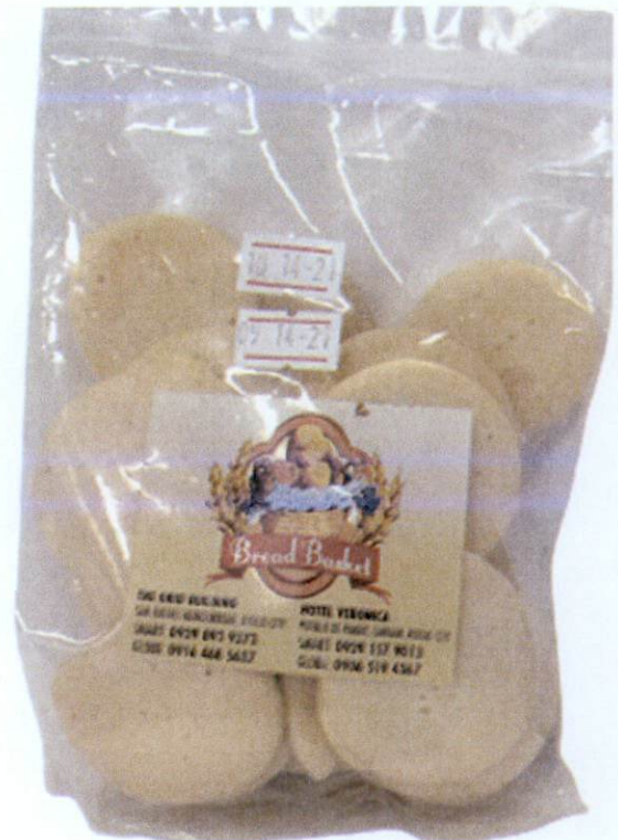
Figure 5. Unregistered BREAD BASKET Biscuit-Like Food in Transparent Packaging