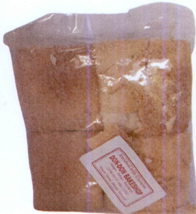
Figure 1. Unregistered DON-DON BAKESHOP (Square Ugoy-Ugoy)

The Food and Drug Administration (FDA) warns all healthcare professionals and the general public NOT TO PURCHASE AND CONSUME the following unregistered food products: