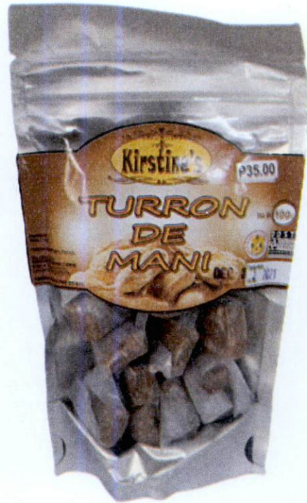
Figure 3. Unregistered KIRSTINE'S Turrón De Mani