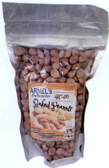
Figure 4. Unregistered ARNEL'S DELICACIES Baked Peanuts