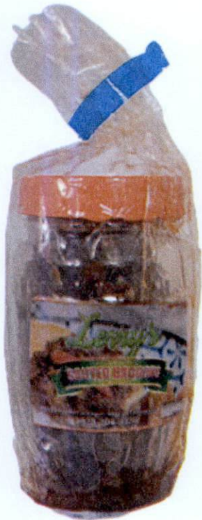
Figure 2. Unregistered LERRY'S Sauted Bagoong