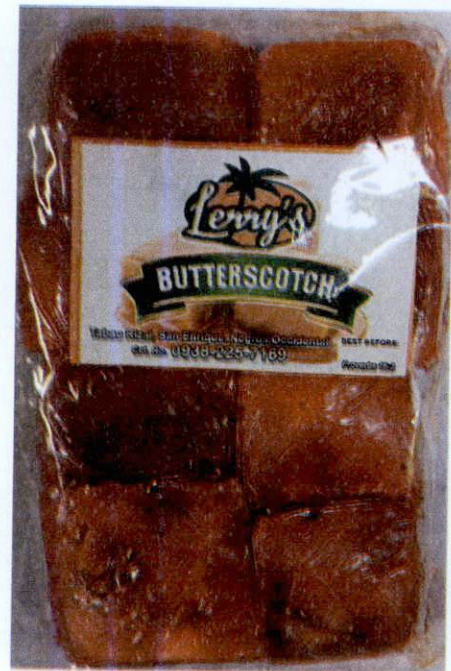
Figure 5. Unregistered LERRY'S Butterscotch