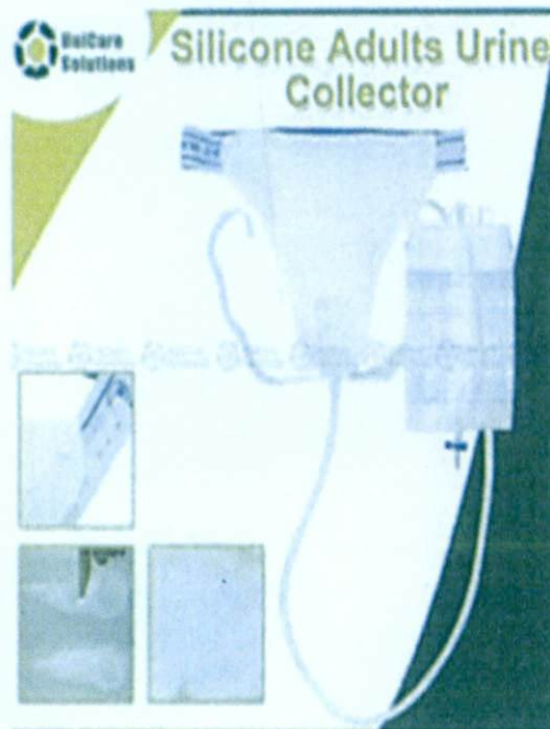
Figure 1. Unnotified UniCare Solutions Silicone Adult Urine Collector

UniCare Solutions Male/Elderly Urine Collector Re-useable Urinal Bag Silicone Piss Collect Bag with 2pcs Urine Catheter Bags / Drainage Bag