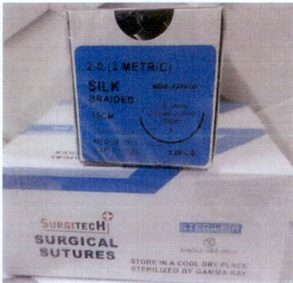
Figure 2. Surgitech Surgical Sutures Silk Braided with Expired Certificate of Product Registration

The FDA verified through post-marketing surveillance that the above-mentioned medical device products have an expired Certificate of Product Registration (CPR). Pursuant to the Republic Act No. 9711, otherwise known as the “Food and Drug Administration Act of 2009”, the manufacture, importation, exportation, sale, offering for sale, distribution, transfer, non-consumer use, promotion, advertising or sponsorship of health products without the proper authorization is prohibited.