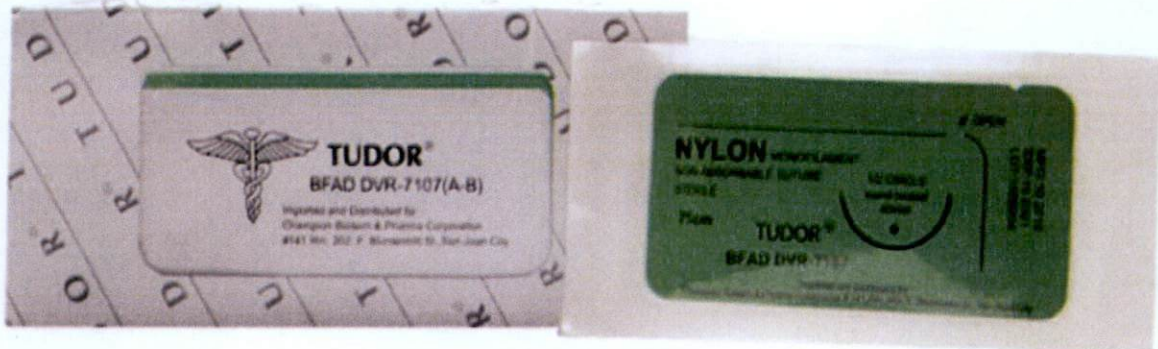
Figure 1. Tudor Nylon Nanofilament Non-Absorbable Suture Sterile with Expired Certificate of Product Registration

The Food and Drug Administration (FDA) warns all healthcare professionals and the general public NOT TO PURCHASE AND USE the medical device products with expired Certificate of Product Registration: