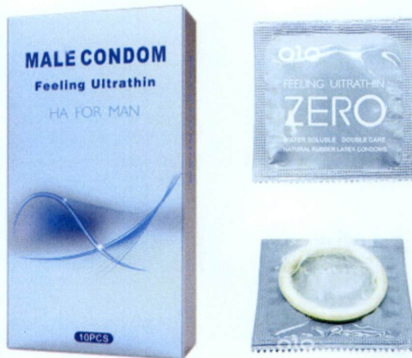
Figure 1. Unregistered Olo Male Condom Feeling Ultrathin ha for Man (10pcs)