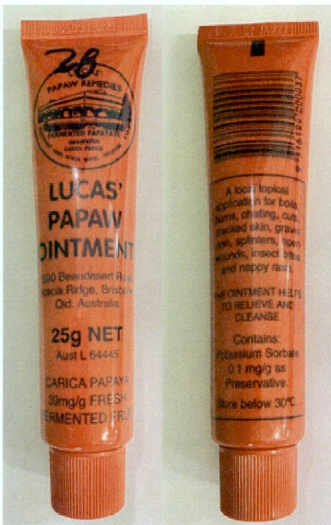
Figure 1. Counterfeit Luca's Papaw Ointment (front & back)

The Food and Drug Administration (FDA) warns the public from purchasing and using the below counterfeit cosmetic product: