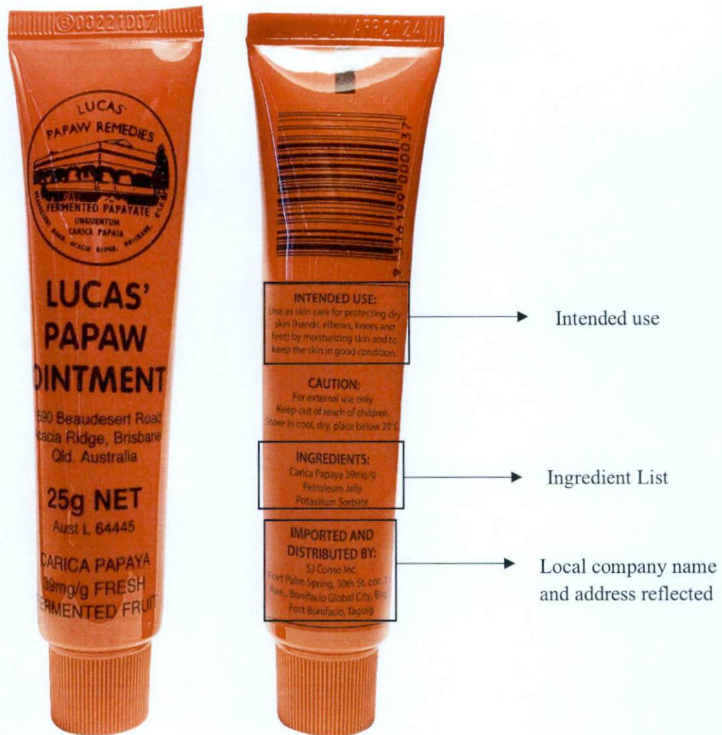
Figure 2. Authentic Luca's Papaw Ointment (front & back)

The FDA has coordinated with the Market Authorization Holder (MAH), SJ CONSO INC., and has verified that the aforementioned cosmetic product is COUNTERFEIT . According to the company SJ CONSO INC., they are not responsible for the importation nor distribution of the aforementioned cosmetic product.