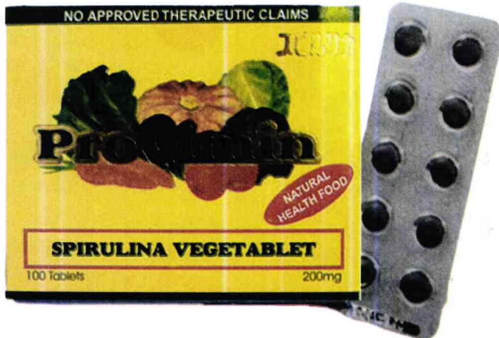
Figure 1. Unregistered PROVIMIN Spirulina Vegetablet 200mg, 100 Tablets

The Food and Drug Administration (FDA) warns all healthcare professionals and the general public NOT TO PURCHASE AND CONSUME the following unregistered food supplements and food products: