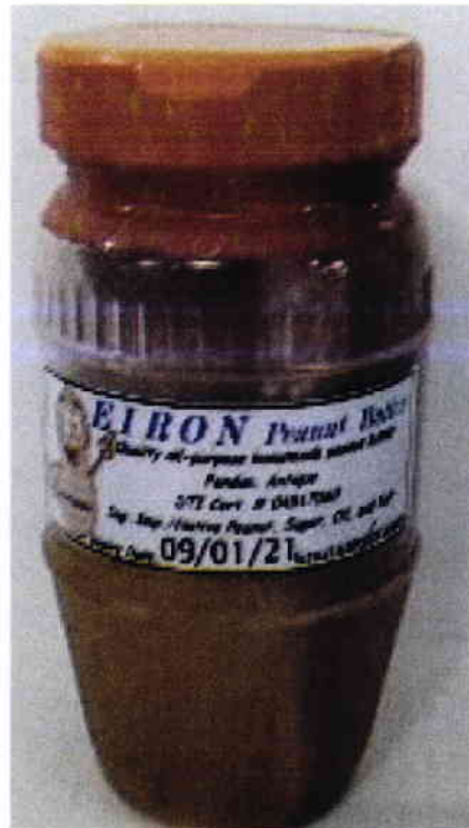
Figure 5. Unregistered EIRON Peanut Butter, Size (S)