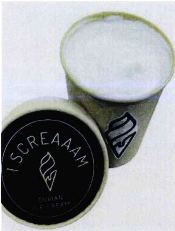
Figure 4. Unregistered ISCREAAAM Durian Ice Cream