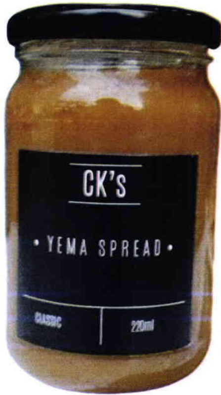
Figure 3. Unregistered CK'S Yema Spread - Classic, 220ml