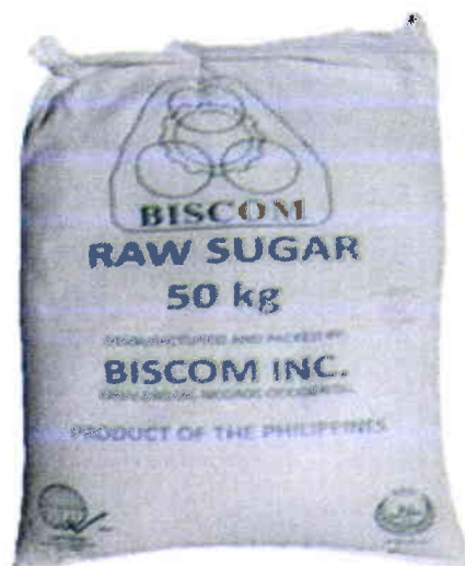
Figure 3. Unregistered BISCOM Raw Sugar, 50Kgs.