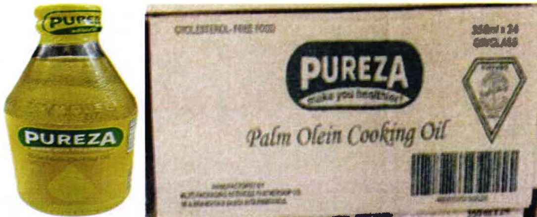
Figure 2. Unregistered PUREZA Palm Olein Cooking Oil, 348ml X 4gin Glass