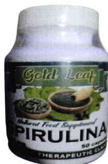
Figure 4. Unregistered GOLD LEAF Spirulina Natural Food Supplement 500mg, 50 Capsules