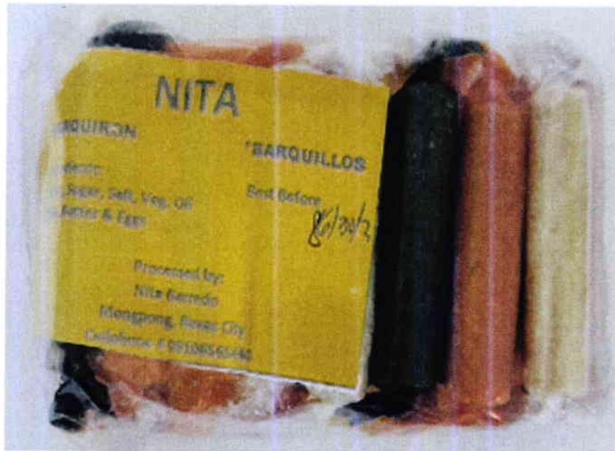
Figure 1. Unregistered NITA Barquillos

The Food and Drug Administration (FDA) warns all healthcare professionals and the general public NOT TO PURCHASE AND CONSUME the following unregistered food products and food supplements: