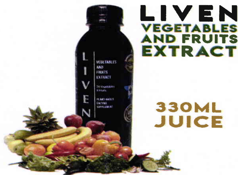
Figure 1. Unregistered LIVEN Vegetables and Fruits Extract Plant Based Enzyme Supplement (Liquid)

The Food and Drug Administration (FDA) warns all healthcare professionals and the general public NOT TO PURCHASE AND CONSUME the following unregistered food supplements and food product: