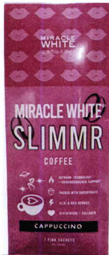
Figure 5. Unregistered MIRACLE WHITE SLIMMR Coffee - Cappuccino