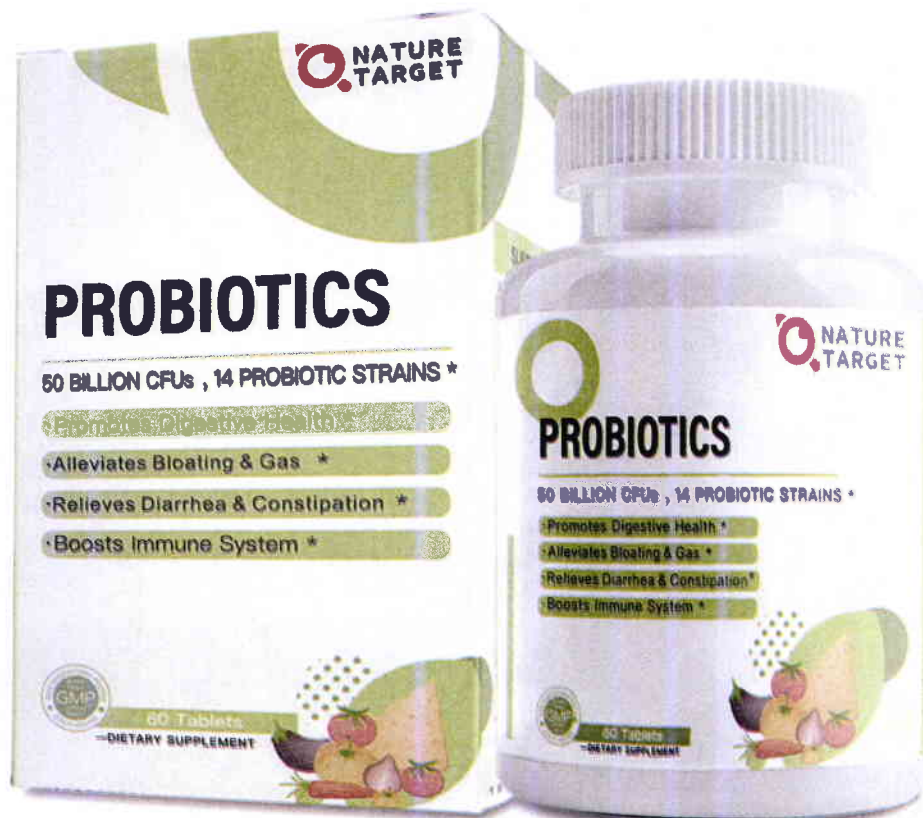
Figure 3. Unregistered NATURE TARGET Probiotics Dietary Supplement