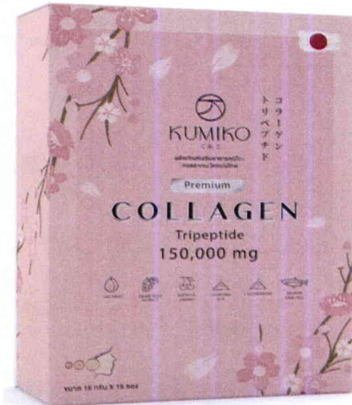
Figure 4. Unregistered KUMIKO Collagen Tripeptide 150,000mg