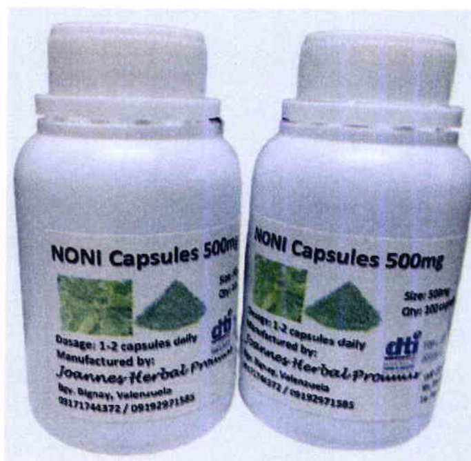
Figure 1. Unregistered JOANNES HERBAL PRODUCTS Noni Capsules 500mg, 100 Capsules

The Food and Drug Administration (FDA) warns all healthcare professionals and the general public NOT TO PURCHASE AND CONSUME the following unregistered food supplements: