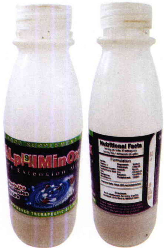
Figure 3. Unregistered ALPHIMINOX Life Extension Food Supplement, 500ml