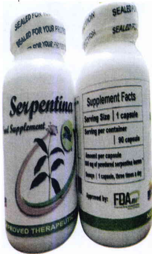
Figure 2. Unregistered (UNBRANDED) Serpentina Herbal Food Supplements, 90 Capsules