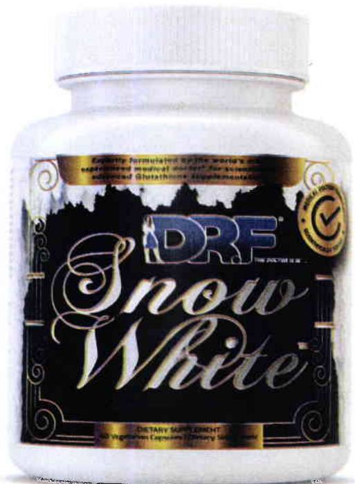
Figure 5. Unregistered DR. F Snow White Dietary Supplement, 60 Vegetarian Capsules