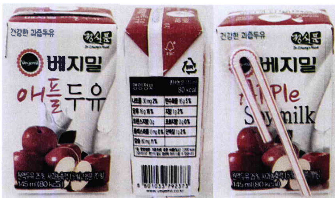
Figure 4. Unregistered DR. CHUNG'S FOOD VEGEMIL Apple Soymilk, 145ml (In foreign language)

The FDA verified through online monitoring or post-marketing surveillance that the abovementioned food products are not registered and no corresponding Certificates of Product Registration (CPR) have been issued. Pursuant to the Republic Act No. 9711, otherwise known as the “Food and Drug Administration Act of 2009”, the manufacture, importation, exportation, sale, offering for sale, distribution, transfer, non-consumer use, promotion, advertising or sponsorship of health products without the proper authorization is prohibited.