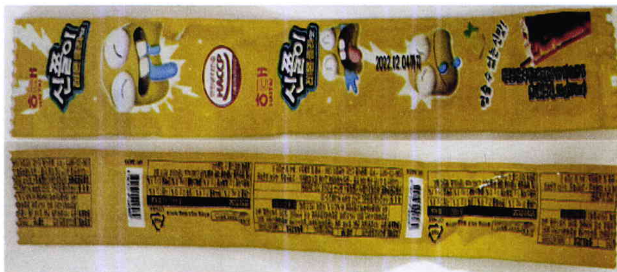
Figure 1. Unregistered HITAI (Gum like food product in yellow packaging with image of lemon) (In foreign language)

The Food and Drug Administration (FDA) warns all healthcare professionals and the general public NOT TO PURCHASE AND CONSUME the following unregistered food products: