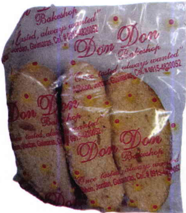
Figure 4. Unregistered DON-DON BAKESHOP (Garlic Bread)