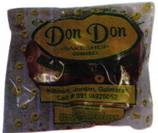
Figure 5. Unregistered DON-DON BAKESHOP (Pan De Sal Small)