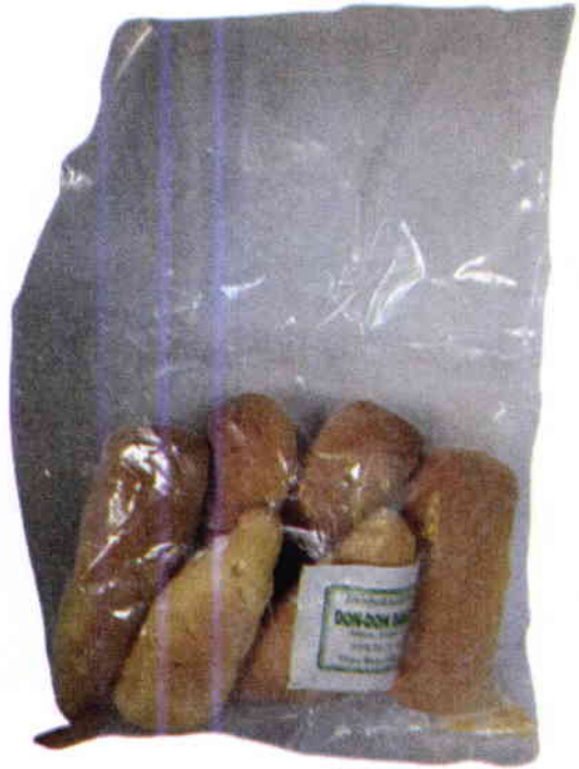
Figure 3. Unregistered DON-DON BAKESHOP (Breadstick)