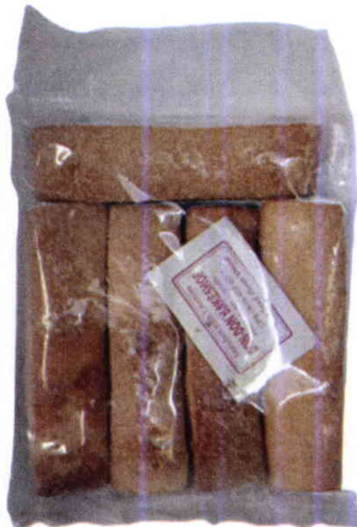
Figure 1. Unregistered DON-DON BAKESHOP (Ugoy-Ugoy)

The Food and Drug Administration (FDA) warns all healthcare professionals and the general public NOT TO PURCHASE AND CONSUME the following unregistered food products: