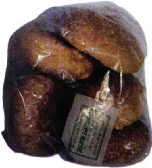
Figure 2. Unregistered DON-DON BAKESHOP (Cheese De Sal)