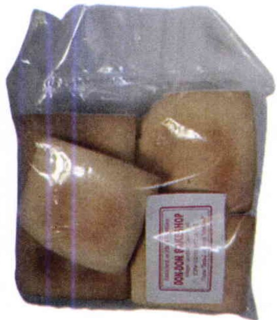
Figure 5. Unregistered DON-DON BAKESHOP (Egg Cracker)