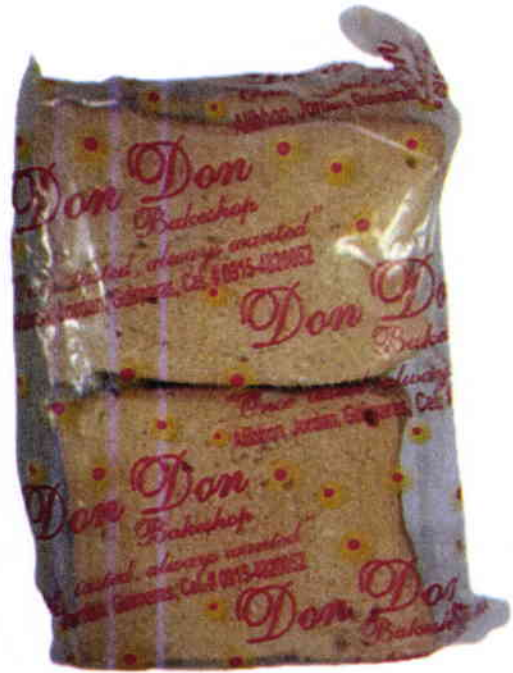
Figure 3. Unregistered DON-DON BAKESHOP (Toasted Bread)