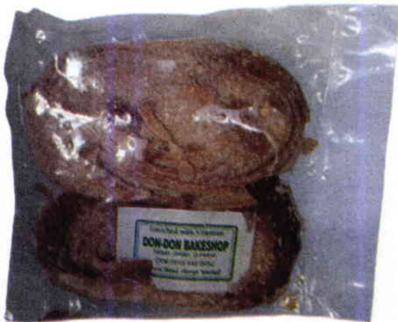
Figure 4. Unregistered DON-DON BAKESHOP (Otap)