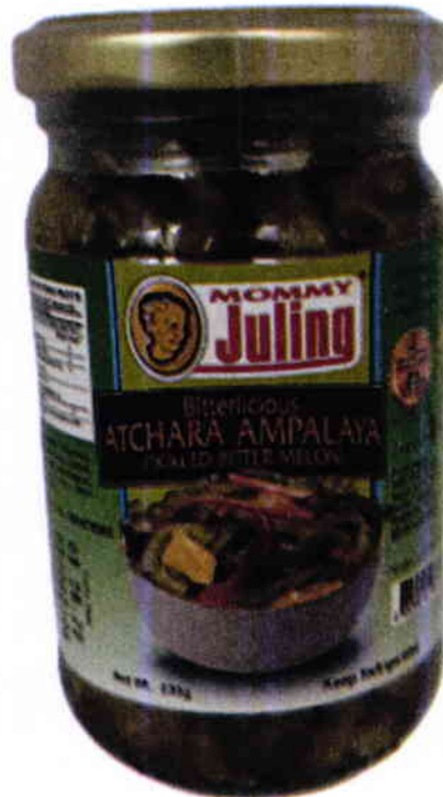
Figure 1. Unregistered MOMMY JULING Bitterlicious Atchara Ampalaya Pickled Bitter Melon

The Food and Drug Administration (FDA) warns all healthcare professionals and the general public NOT TO PURCHASE AND CONSUME the following unregistered food products: