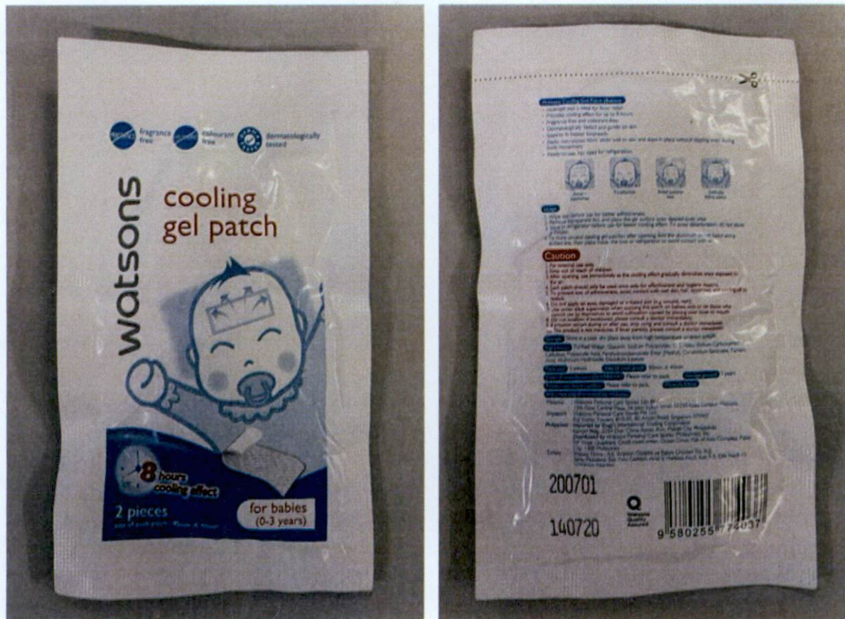
Figure 1. Unnotified Watsons Cooling Gel Patch for Babies

The Food and Drug Administration (FDA) warns all healthcare professionals and the general public NOT TO PURCHASE AND USE the unnotified medical device product: