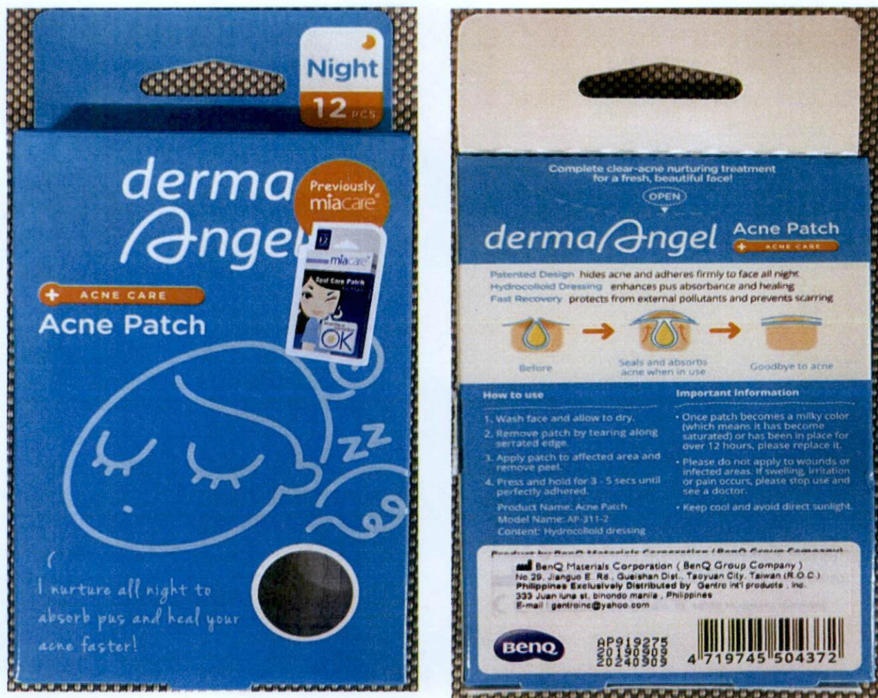
Figure 2. Unnotified Derma Angel Acne Patch for Night 12pcs

The FDA verified through post-marketing surveillance that the above mentioned medical device products are not notified and no corresponding Product Notification Certificates have been issued. Pursuant to the Republic Act No. 9711, otherwise known as the “Food and Drug Administration Act of 2009”, the manufacture, importation, exportation, sale, offering for sale, distribution, transfer, non-consumer use, promotion, advertising or sponsorship of health products without the proper authorization is prohibited.