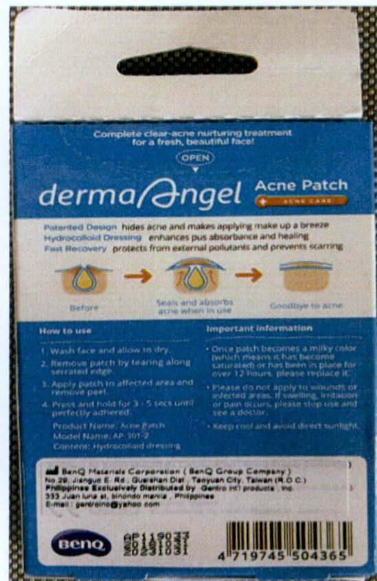
Figure 1. Unnotified Derma Angel Acne Patch for Day 12pcs