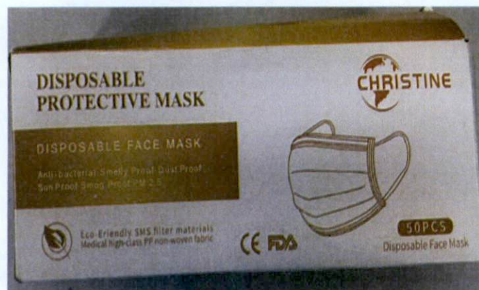
Figure 1. Unnotified Christine Disposable Face Mask