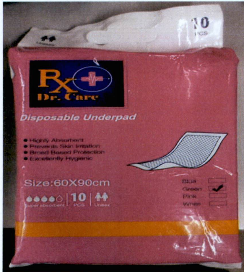
Figure 1. Unnotified RX Dr. Care Disposable Underpad 60x90cm 10 pcs

The Food and Drug Administration (FDA) warns all healthcare professionals and the general public NOT TO PURCHASE AND USE the unnotified medical device product: