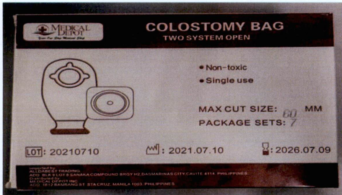
Figure 1. Unregistered Medical Depot Colostomy Bag 60mm 7 pcs

The Food and Drug Administration (FDA) warns all healthcare professionals and the general public NOT TO PURCHASE AND USE the unregistered medical device product: