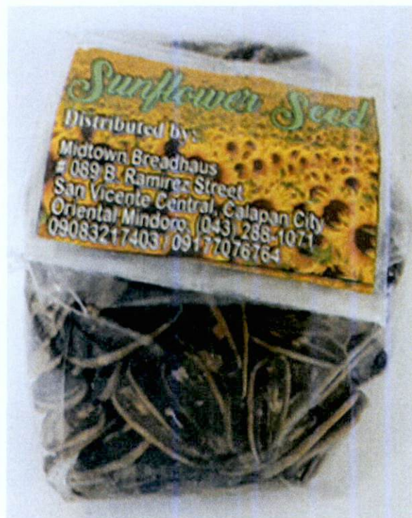
Figure 1. Unregistered (UNBRANDED) Sunflower Seeds by Midtown Breadhaus

The Food and Drug Administration (FDA) warns all healthcare professionals and the general public NOT TO PURCHASE AND CONSUME the following unregistered food products: