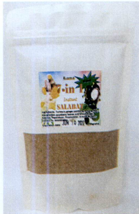
Figure 3. Unregistered LANZ 7-in-1 Instant Salabat, 160grams