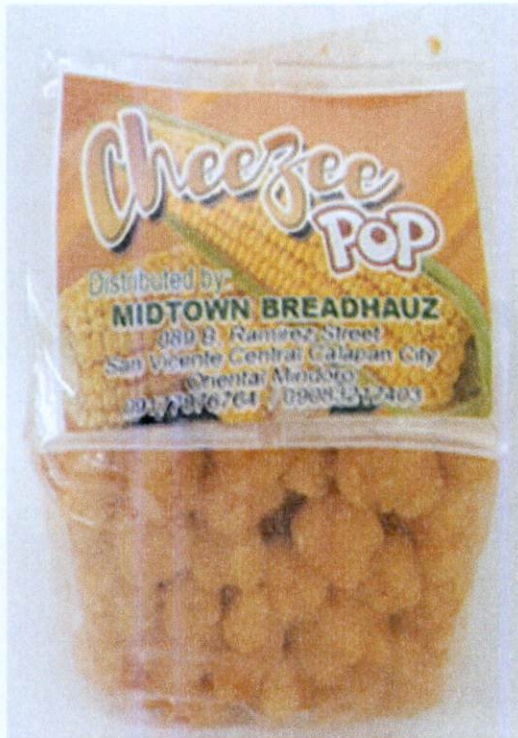
Figure 2. Unregistered (UNBRANDED) Cheeze Pop, by Midtown Breadhaus