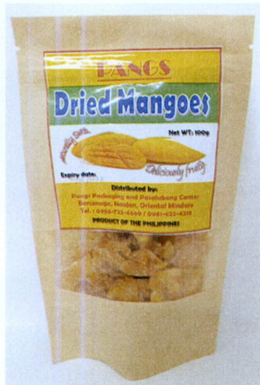
Figure 5. Unregistered PANGS Dried Mangoes, Net Wt. 100g