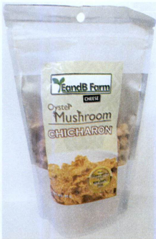
Figure 4. Unregistered EANDB FARM Oyster Mushroom Chicharon – Cheese, Net Wt. 80g,