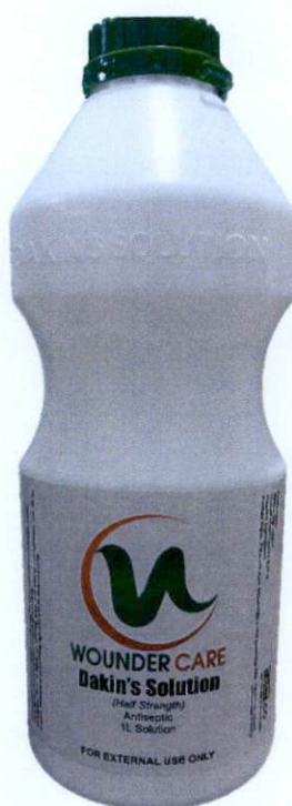
Wounder Care Dakin's Solution (Half Strength) 1L Solution Manufactured by: LBCT.CO