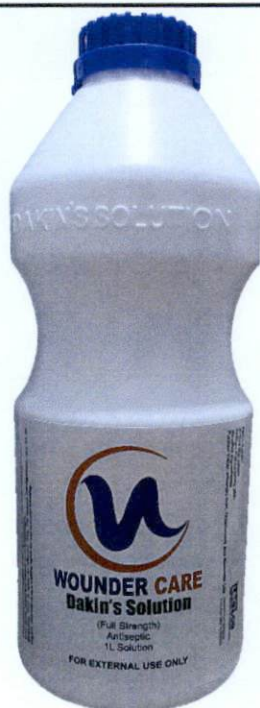
Wounder Care Dakin's Solution (Full Strength) 1L Solution Manufactured by: LBCT.CO